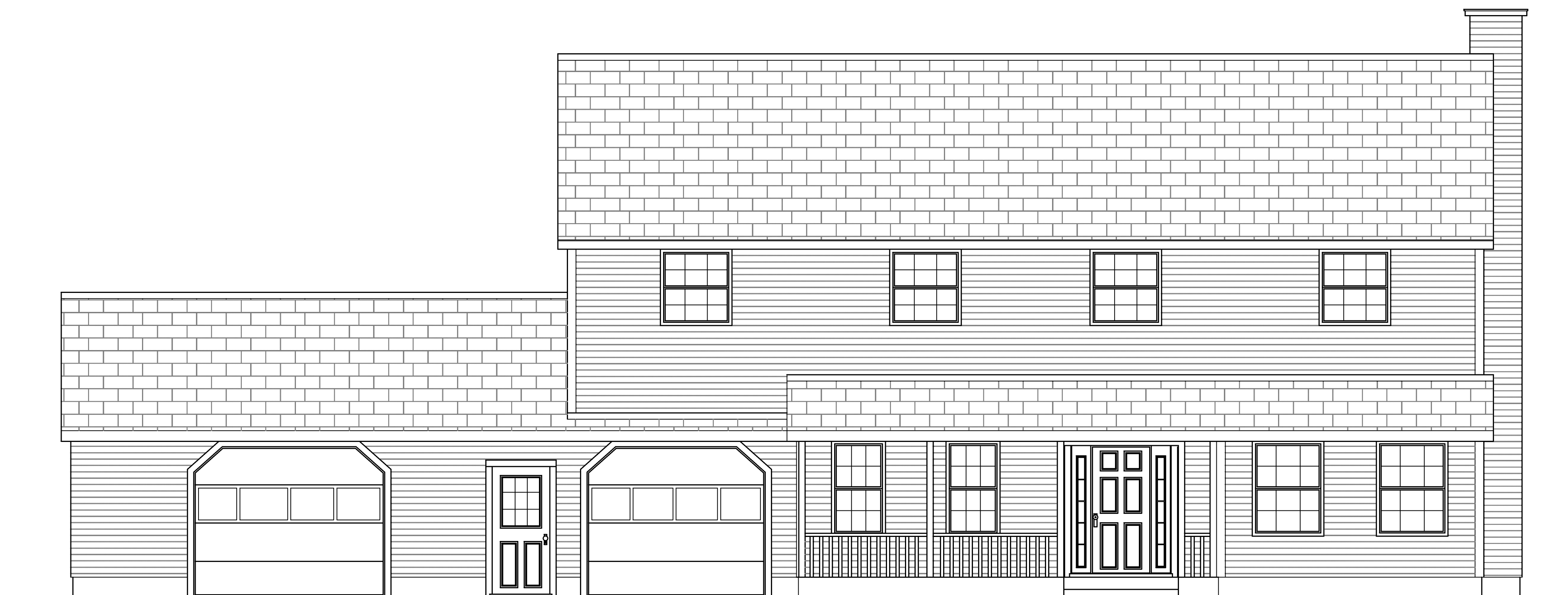
1 FRONT ELEVATION 1/4" = 1'-0"