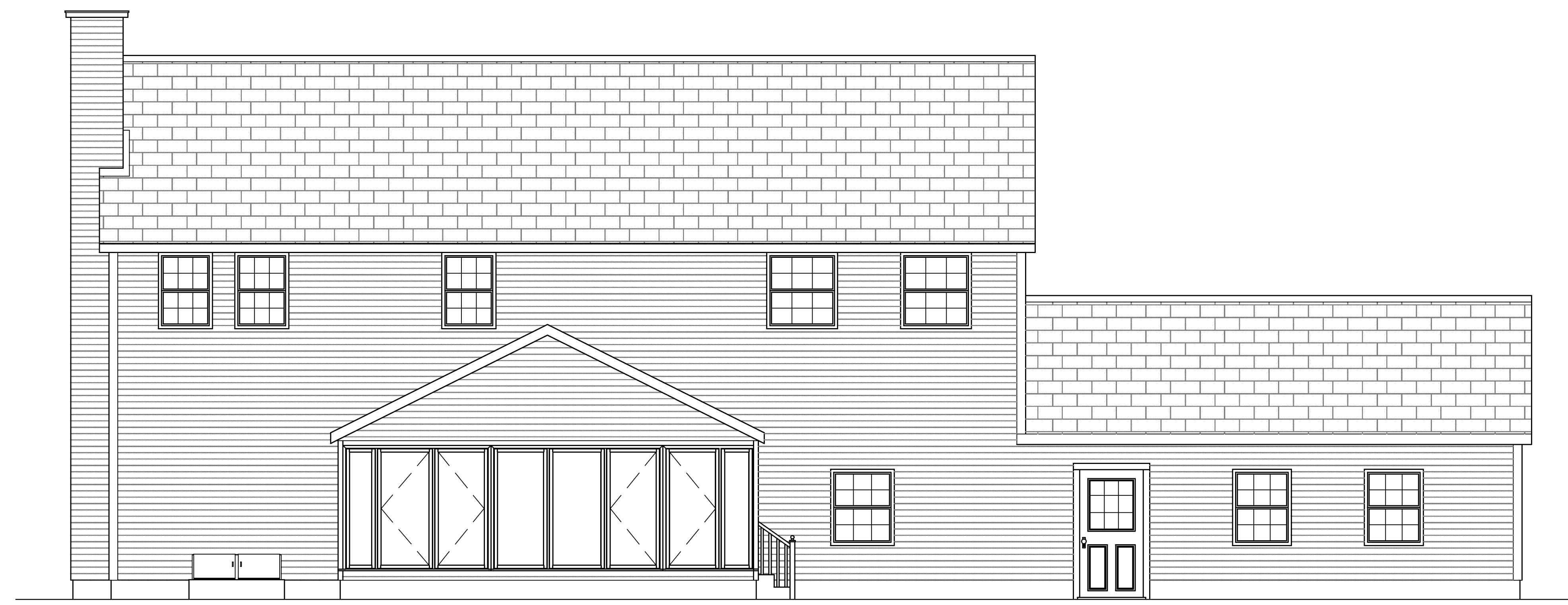
3 REAR ELEVATION 1/4" = 1'-0"

NOTE: THIS DRAWING IS PROVIDED FOR INFORMATIONAL PURPOSES ONLY. IF USED FOR CONSTRUCTION, THE CONTRACTOR ASSUMES ALL RESPONSIBILITY FOR LOCAL CODE COMPLIANCE. ALL DRAWINGS, PLANS, SKETCHES ETC. ARE PROVIDED TO OUR CLIENTS BASED UPON INFORMATION PROVIDED BY THE CLIENT AND DRAWN IN ACCORDANCE WITH COMMON BUILDING PRACTICES AND LOCAL CODES. NONE OF THE EMPLOYEES OF FMC CADD DRAFTING SERVICES, INC. ARE REGISTERED ARCHITECTS, ENGINEERS OR LAND SURVEYORS. ALL DIMENSIONS AND SPECIFICATIONS SHOULD BE VERIFIED BY CLIENT AND/OR CONTRACTOR BEFORE ACTUAL CONSTRUCTION BEGINS. IF DIMENSIONS AND SPECIFICATIONS ARE NOT VERIFIED BY CLIENT AND/OR CONTRACTOR BEFORE ACTUAL CONSTRUCTION BEGINS FMC CADD DRAFTING SERVICES, INC. WILL BE HELD HARMLESS. FMC CADD DRAFTING SERVICES, INC. ASSUMES NO LIABILITY FOR CHANGES AND/OR REVISIONS MADE TO PLANS BY CLIENT AND/OR CONTRACTOR.