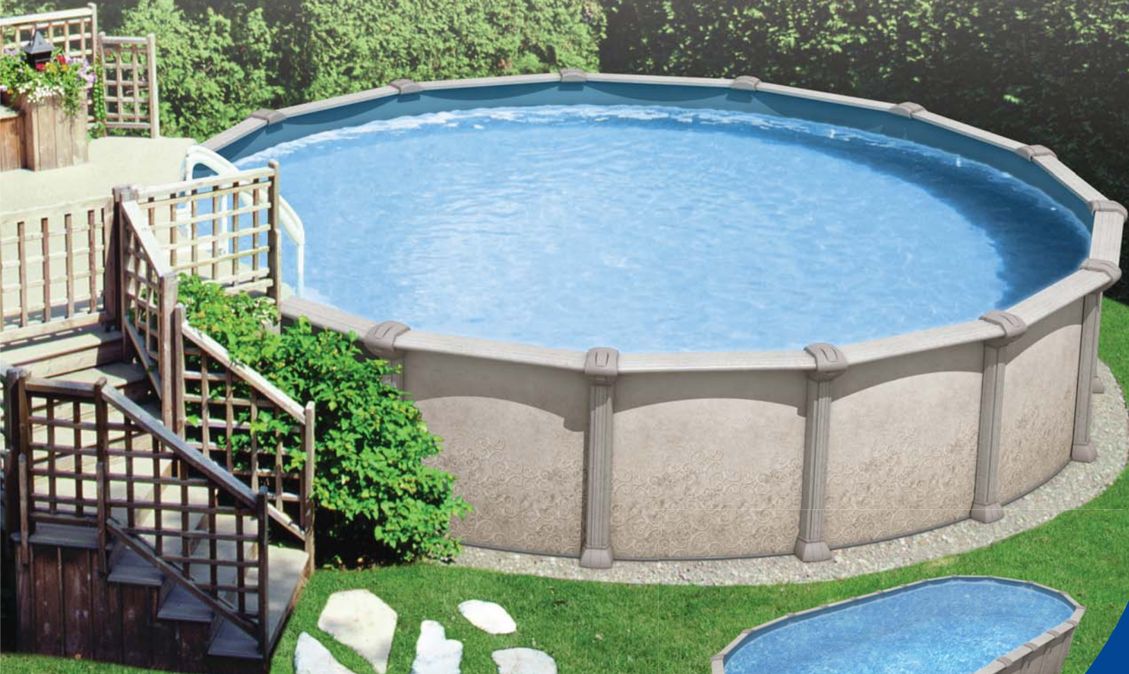
Oval pool with invisible supports

Wall and structure now coordinated for style