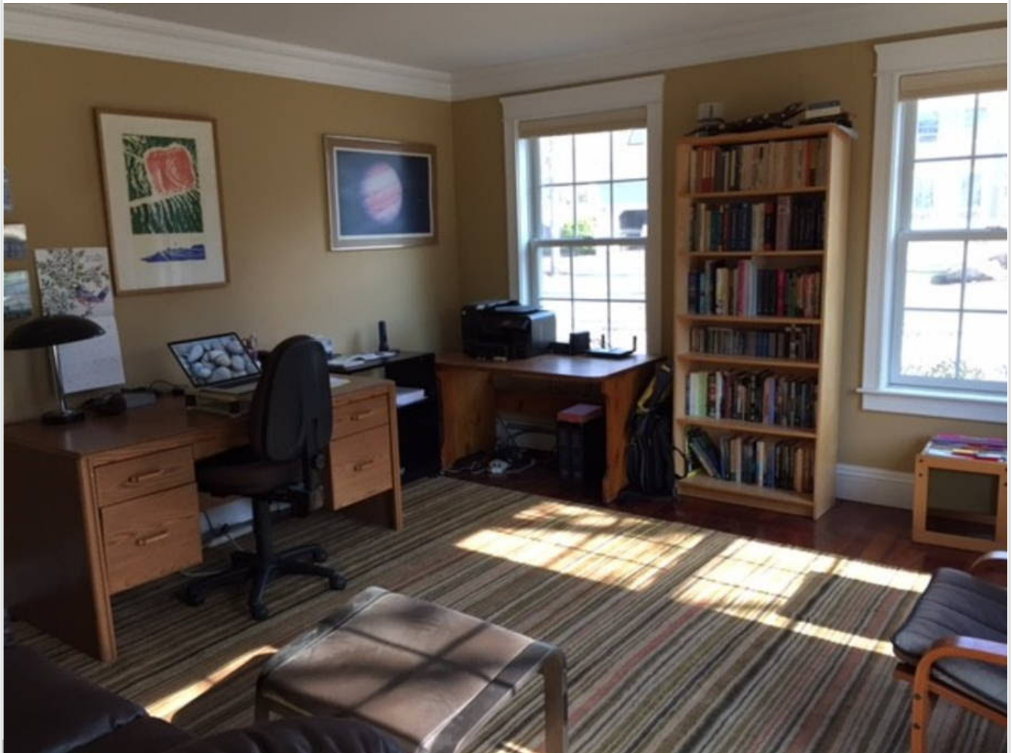
Downstairs study looking out to street.