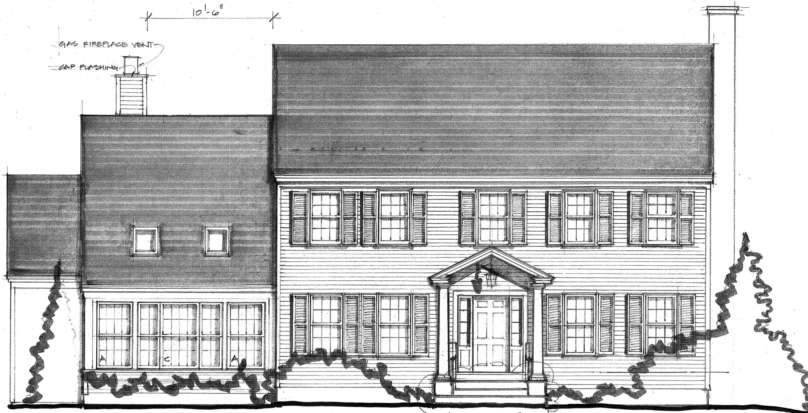
FRONT ELEVATION SCALE 1/4" = 1'-0"