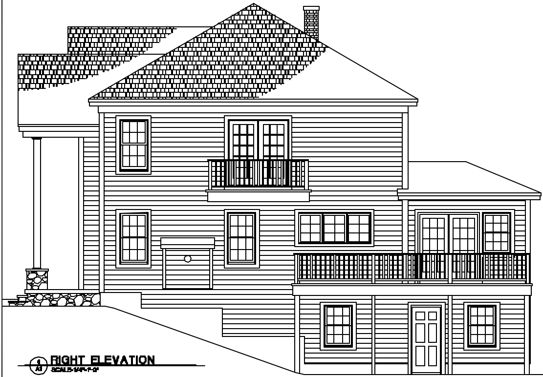
RIGHT ELEVATION SCALE: 1/4"=1'-0"