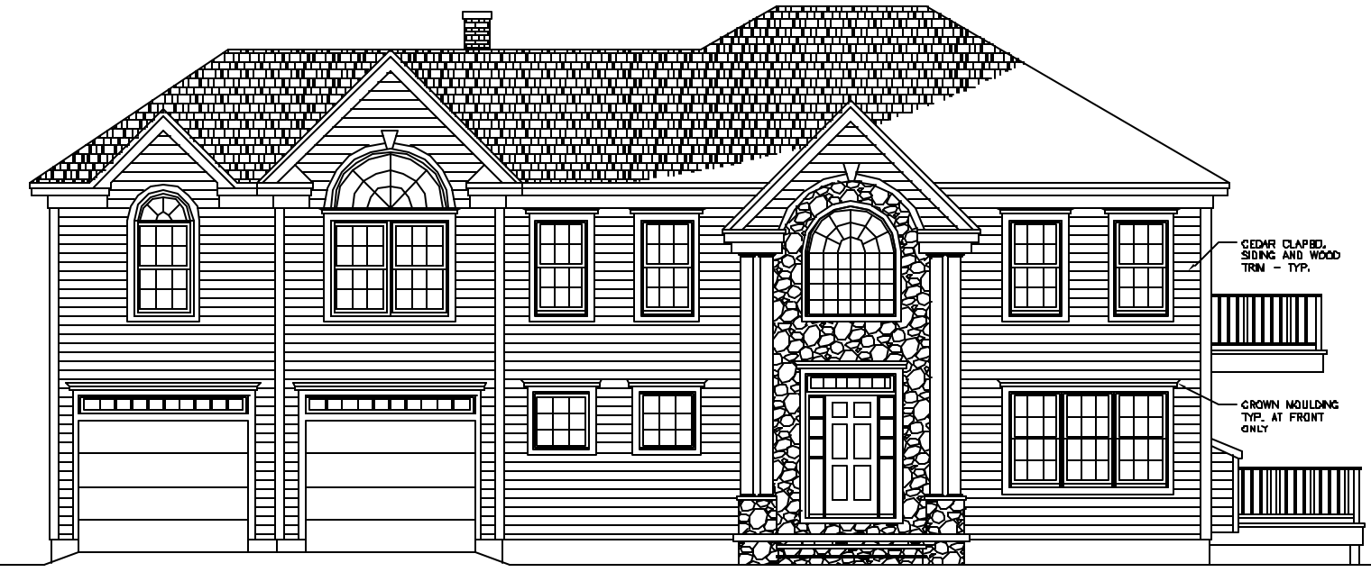
FRONT ELEVATION SCALE: 1/4"=1'-0"

CEDAR CLAPED, SIDING AND WOOD TRIM - TYP. CROWN MOULDING TYP. AT FRONT ONLY