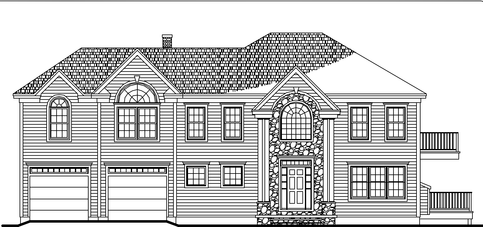
FRONT ELEVATION SCALE: 1/4"=1'-0"