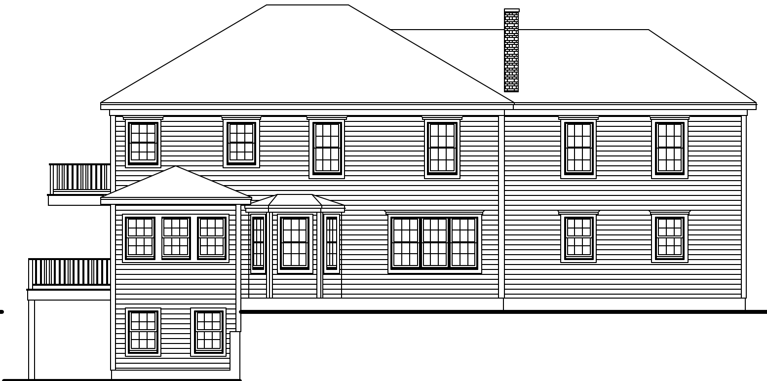
REAR ELEVATION SCALE: 1/4"=1'-0"

NOTE: THIS DRAWING IS PROVIDED FOR INFORMATION PURPOSES ONLY. IT IS NOT TO BE USED FOR CONSTRUCTION OR ANY OTHER PURPOSE. ALL DRAWINGS, PLANS, SPECIFICATIONS, ETC. ARE PROVIDED TO OUR CLIENTS BASED UPON INFORMATION PROVIDED BY THE CLIENT. WE DO NOT GUARANTEE THE ACCURACY OF THE INFORMATION PROVIDED. AND WE ARE NOT RESPONSIBLE FOR ANY ERRORS OR OMISSIONS. ALL DRAWINGS, PLANS, SPECIFICATIONS, ETC. ARE PROVIDED TO OUR CLIENTS BASED UPON INFORMATION PROVIDED BY THE CLIENT. WE DO NOT GUARANTEE THE ACCURACY OF THE INFORMATION PROVIDED. AND WE ARE NOT RESPONSIBLE FOR ANY ERRORS OR OMISSIONS. ALL DRAWINGS, PLANS, SPECIFICATIONS, ETC. ARE PROVIDED TO OUR CLIENTS BASED UPON INFORMATION PROVIDED BY THE CLIENT. WE DO NOT GUARANTEE THE ACCURACY OF THE INFORMATION PROVIDED. AND WE ARE NOT RESPONSIBLE FOR ANY ERRORS OR OMISSIONS.