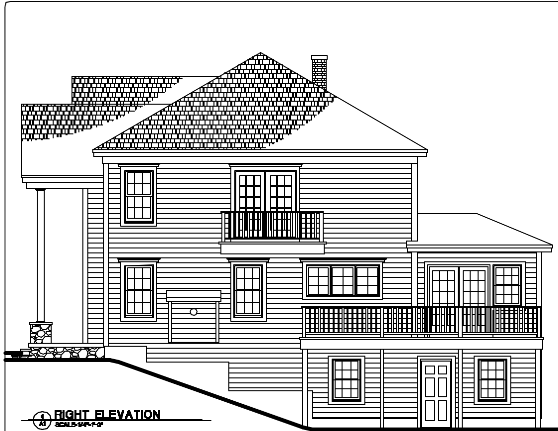
RIGHT ELEVATION SCALE: 1/4"=1'-0"