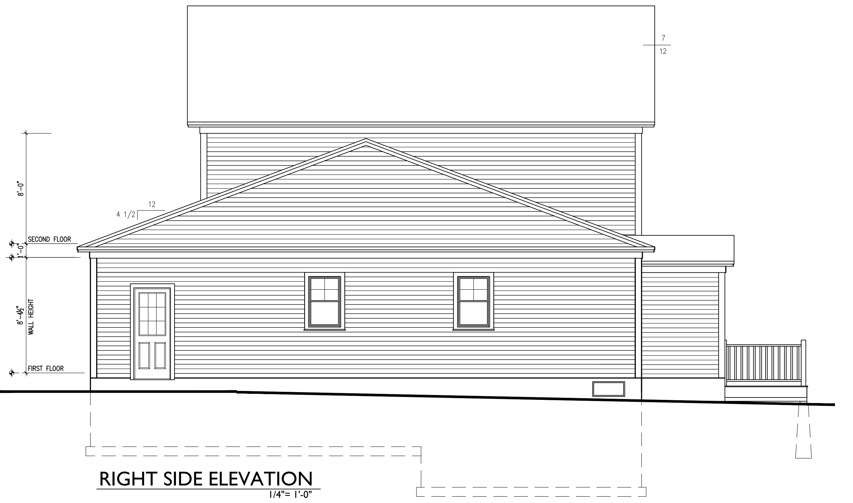
RIGHT SIDE ELEVATION 1/4" = 1'-0"