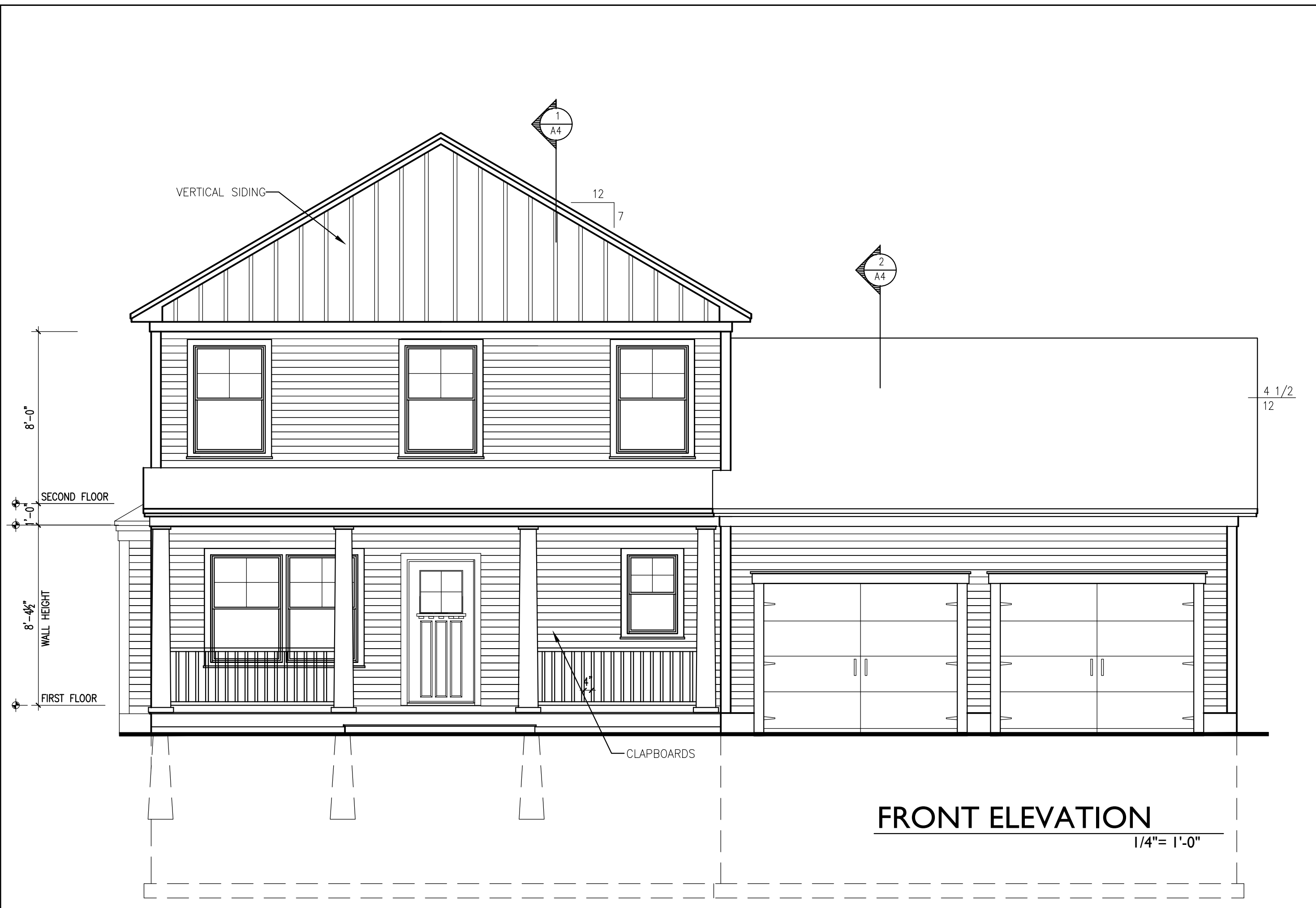
FRONT ELEVATION 1/4" = 1'-0"