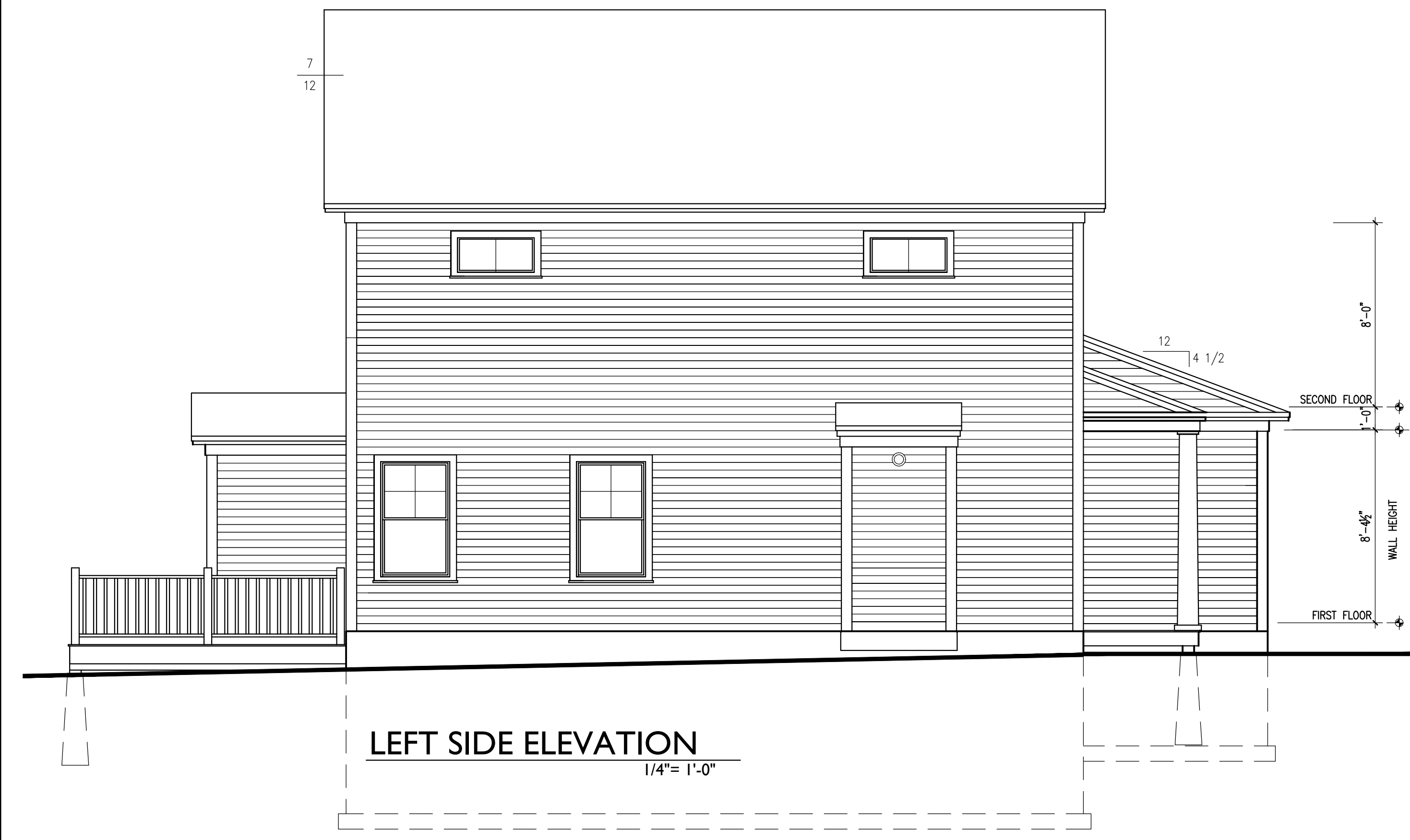
LEFT SIDE ELEVATION 1/4" = 1'-0"