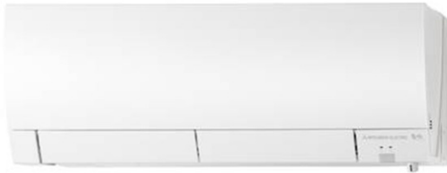
Indoor Unit: MSZ-FH18NA