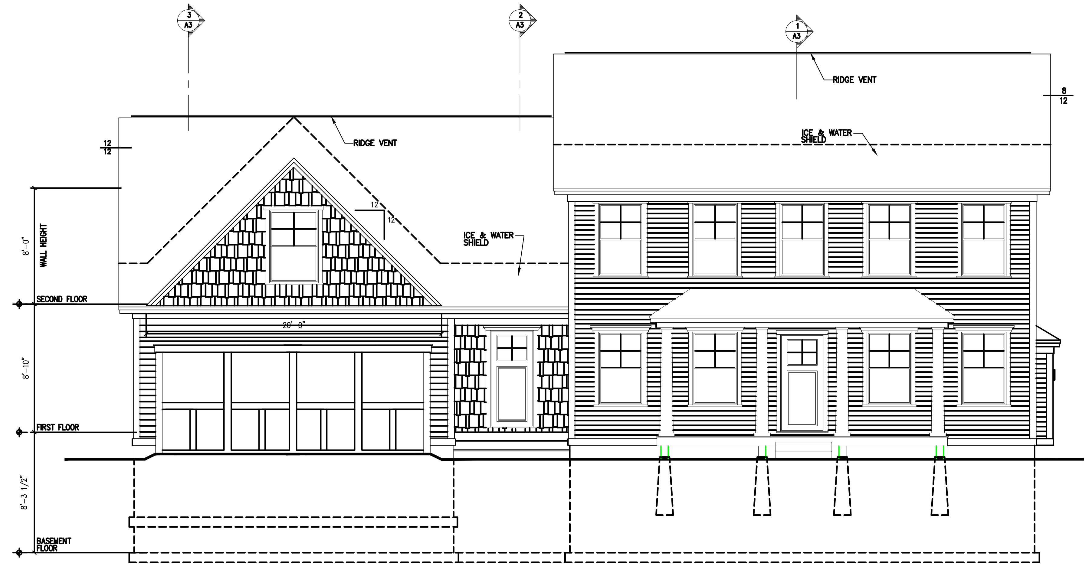
FRONT ELEVATION 1/4"=1'-0"