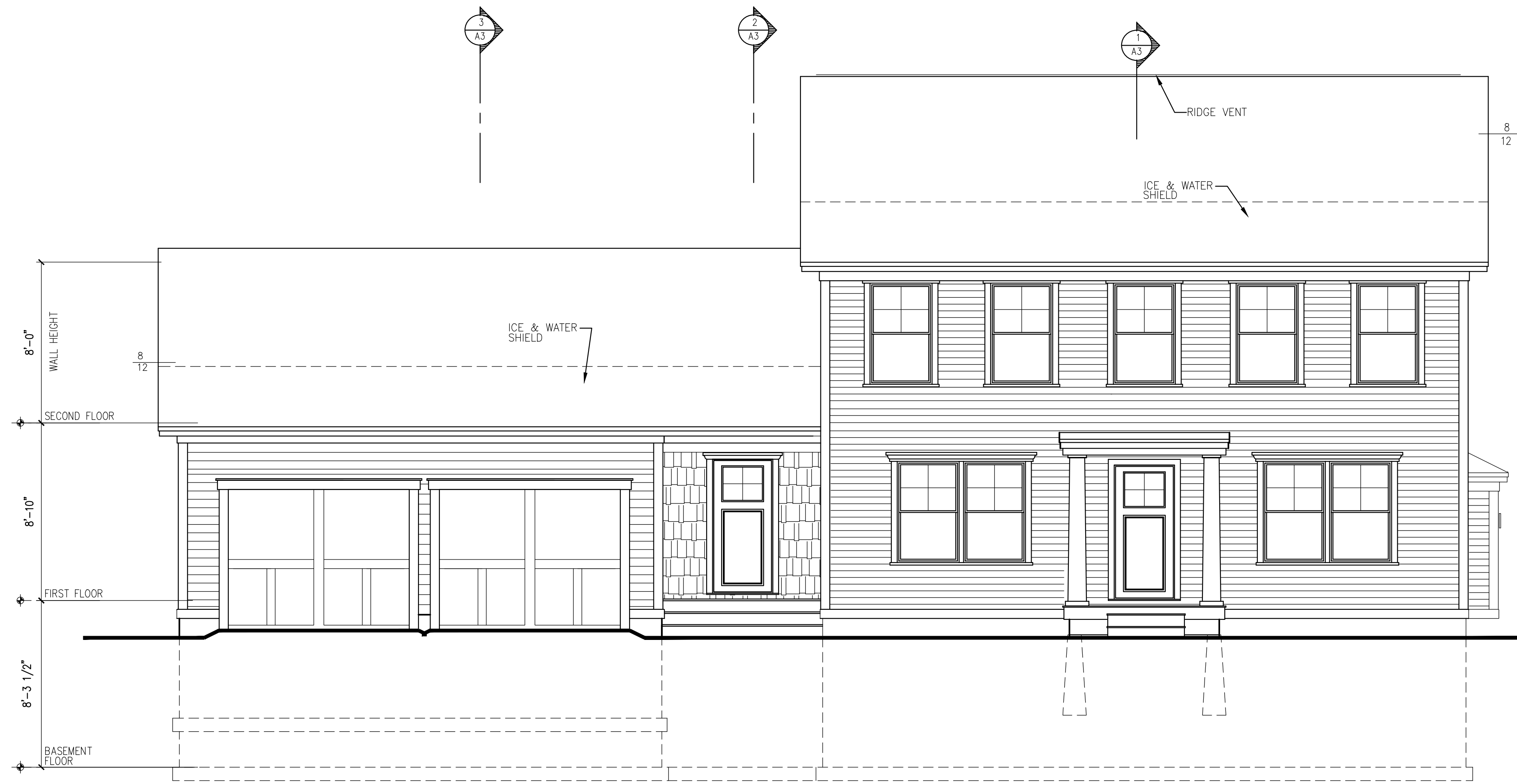
FRONT ELEVATION 1/4"=1'-0"