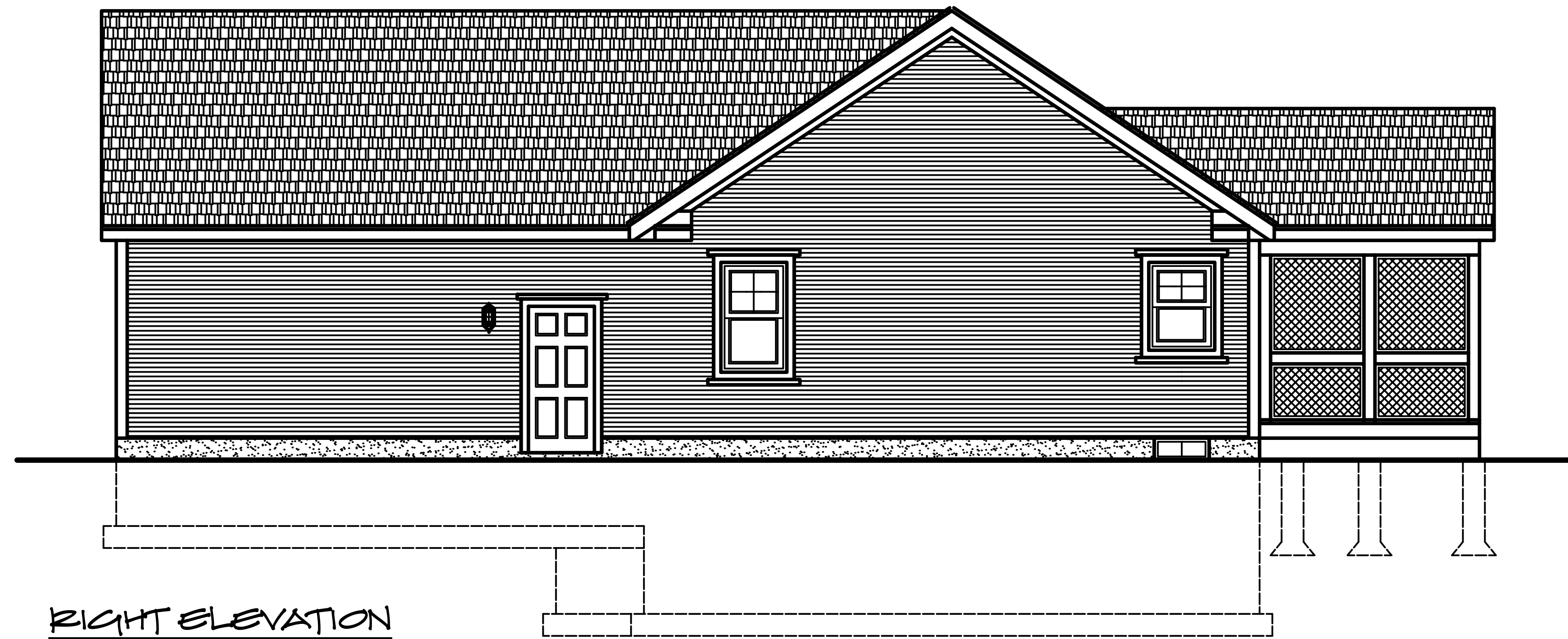
RIGHT ELEVATION 1/4" = 1'-0"