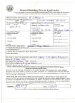
C-1 Building Permit N. Varney Builders 001.jpg 534K