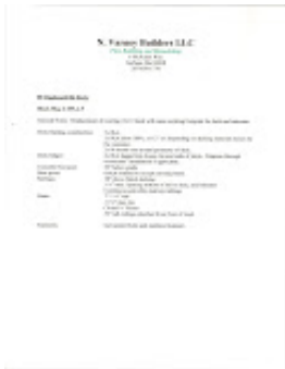
C-7 General Notes Of Deck Project N. Varney Builders Llc 001.jpg 202K