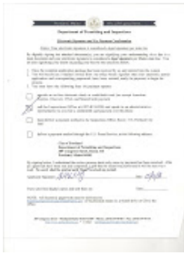
C-2 Building Permit N. Varney Builders Llc 001.jpg 400K