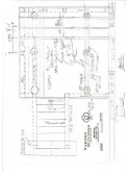
A-1 Deck Framing Plan N. Varney Builders Llc 001.jpg 540K