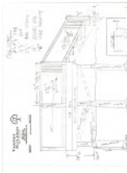
A-2 Deck Crossection N. Varney Builders Llc 001.jpg 441K