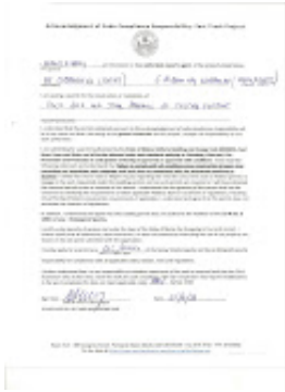
C-3 Fast Track Form 1of2 N. Varney Builders Llc 001.jpg 443K