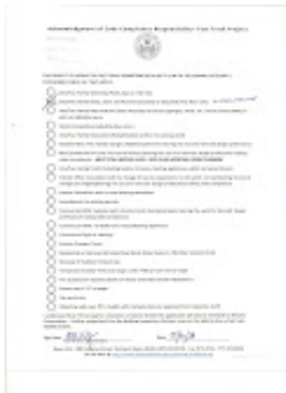
C-4 Fastrack 2of2 N. Varney Builders Llc 001.jpg 372K