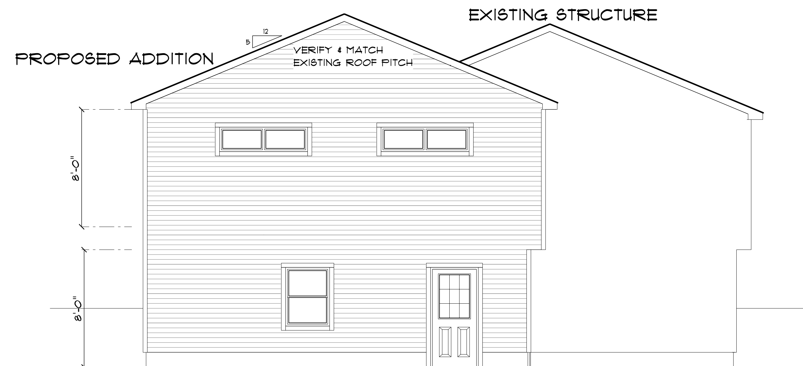
FRONT ELEVATION SCALE: 1/4" = 1'-0"

ADDITION LEVELS DETERMINED BY EXISTING LEVELS VERIFY AND MATCH EXISTING