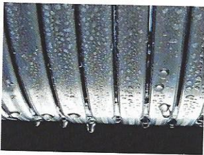
Stainless steel Inox-Radial heat exchanger

The Vitodens 100 is ENERGY STAR® qualified and EcoLogo™ certified. By choosing the Vitodens 100, you are helping to promote cleaner air and a healthier environment.