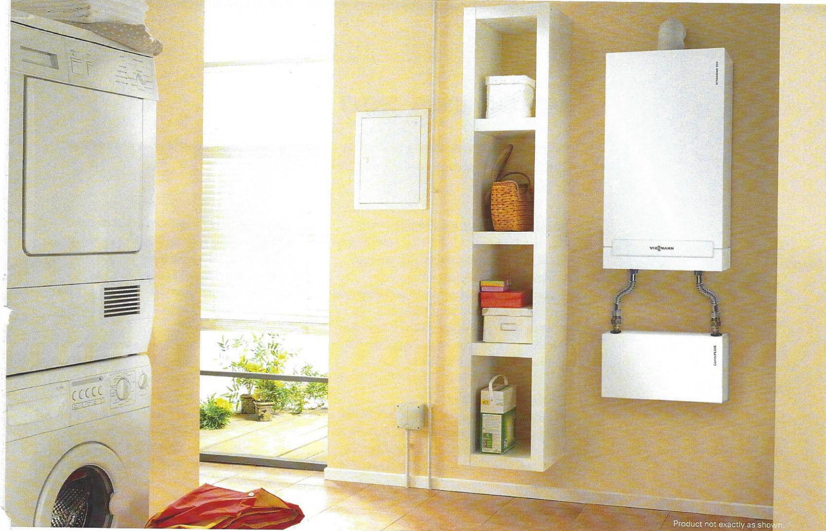
Product not exactly as shown.