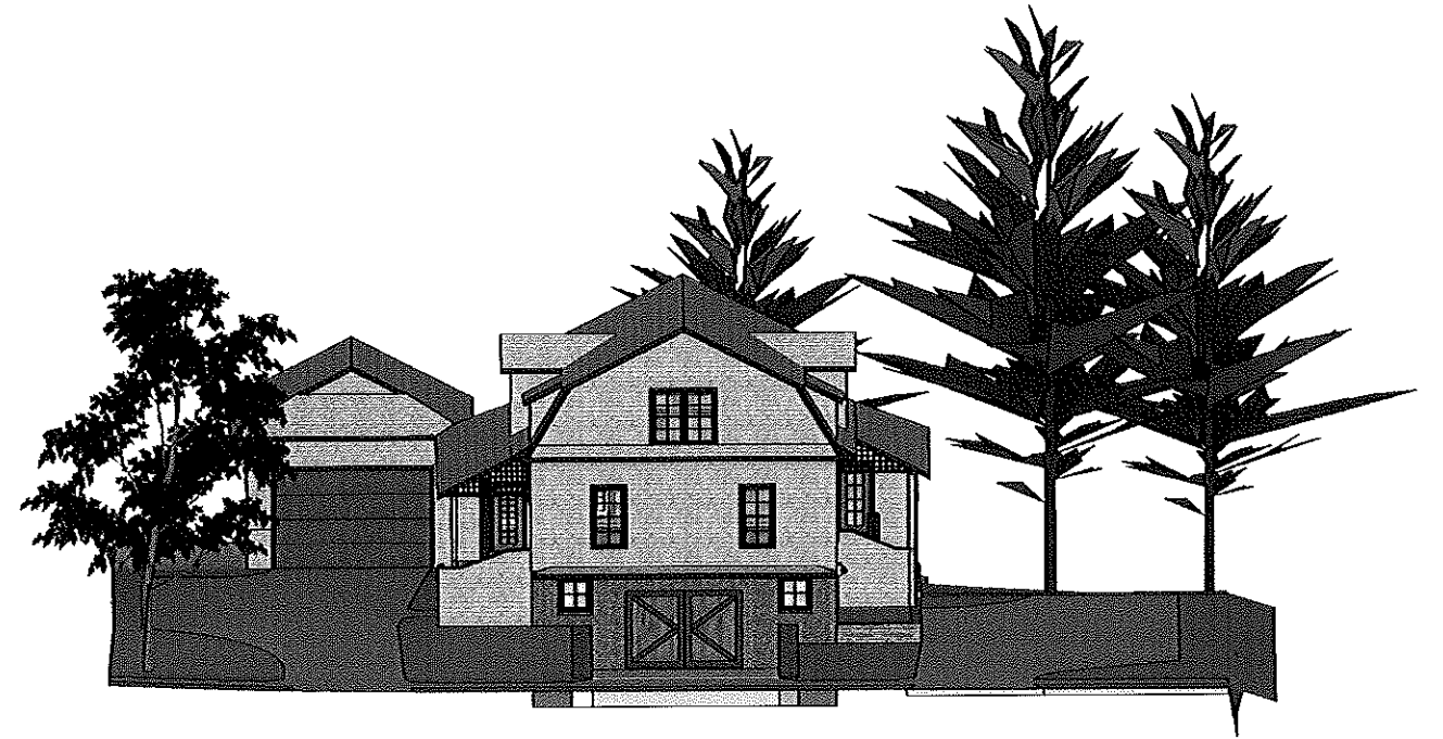
Driving By-on Morningstar Lane