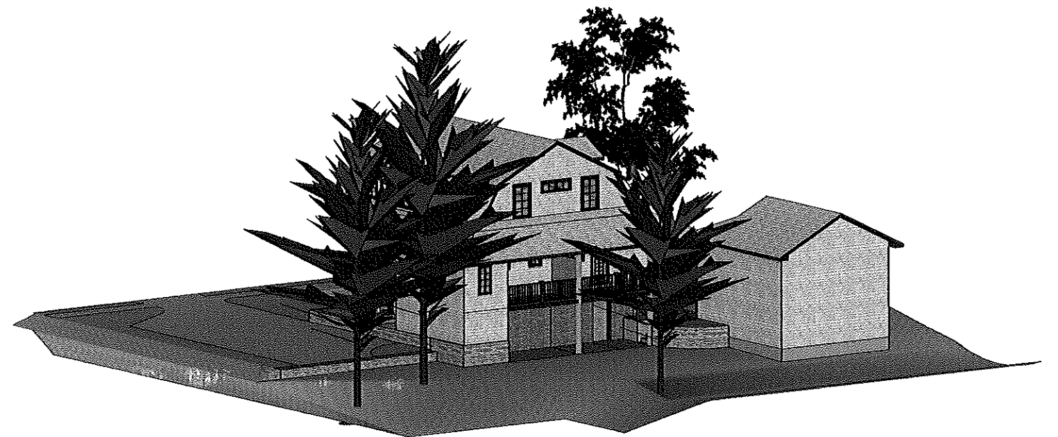
Back Side-View from Rowe residence