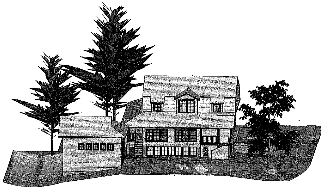
South Side--view from Lot #3