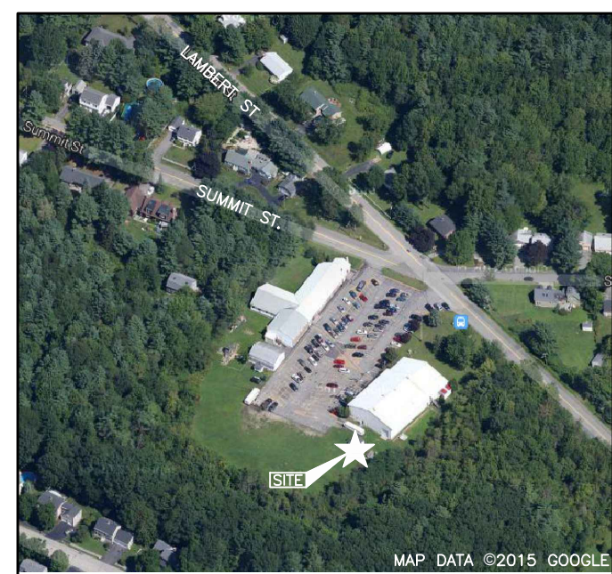
VICINITY MAP SCALE: N.T.S.

DIRECTIONS TO SITE: GET ON I-495 N FROM FRIBERG PKWY AND MA-9 E/STATE HWY 9 E/BOSTON WORCESTER TURNPIKE. HEAD NORTHWEST ON FRIBERG PKWY TOWARD RESEARCH DR TURN LEFT ONTO RESEARCH DR. TURN RIGHT TO MERGE ONTO MA-9 E/STATE HWY 9 E/BOSTON WORCESTER TURNPIKE. MERGE ONTO I-495 N VIA THE RAMP TO LOWELL. FOLLOW I-495 N AND I-95 N TO ME-100 S/ME-26 S IN FALMOUTH. TAKE EXIT 53 FROM I-95 N. MERGE ONTO I-495 N CONTINUE ONTO EXIT 60 (SIGNS FOR ROUTE 286/BEACHES/SALISBURY) MERGE ONTO I-95 N. ENTERING NEW HAMPSHIRE KEEP LEFT AT THE FORK TO STAY ON I-95 N. ENTERING MAINE TAKE EXIT 53 TOWARD MAINE ME 26 W/MAINE ME 100 W/FALMOUTH CONTINUE ON ME-100 S/ME-26 S. DRIVE TO SUMMIT ST IN PORTLAND TURN RIGHT ONTO ME-100 S/ME-26 S. TURN RIGHT ONTO SUMMIT ST TURN RIGHT ONTO LAMBERT ST. TURN LEFT ONTO SUMMIT ST DESTINATION WILL BE ON THE LEFT. 476 SUMMIT ST. PORTLAND, ME 04103