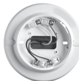
Model SBGA-34 (Front View)

Model SBGA-34 can be used with the following Siemens fire systems: FireFinder XLS, Cerberus PRO, FireSeeker FS-250 and PAD-series NAC Extenders.