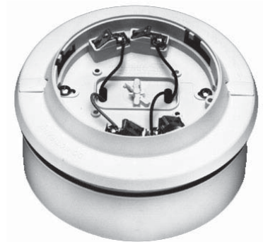
ADB-BOX with Audible Base Installed