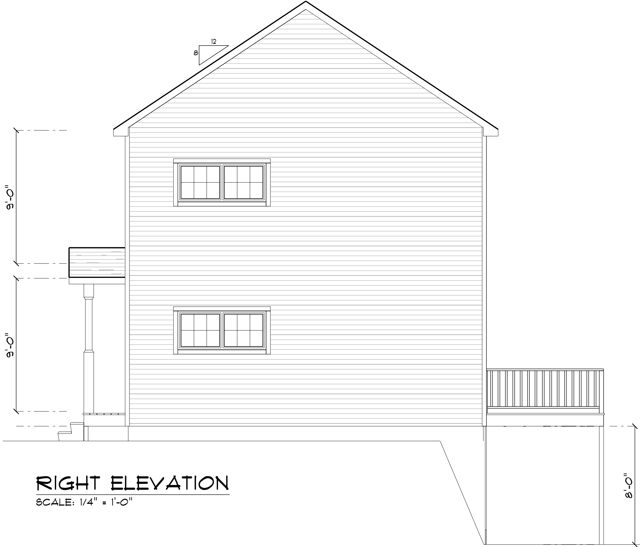
RIGHT ELEVATION SCALE: 1/4" = 1'-0"

SPECIFY HEADERS: TYPICAL: 2 FLY 2X10 TO BE VERIFIED/SIZED BY CONTRACTOR, HOMEOWNER, OR STRUCTURAL ENGINEER