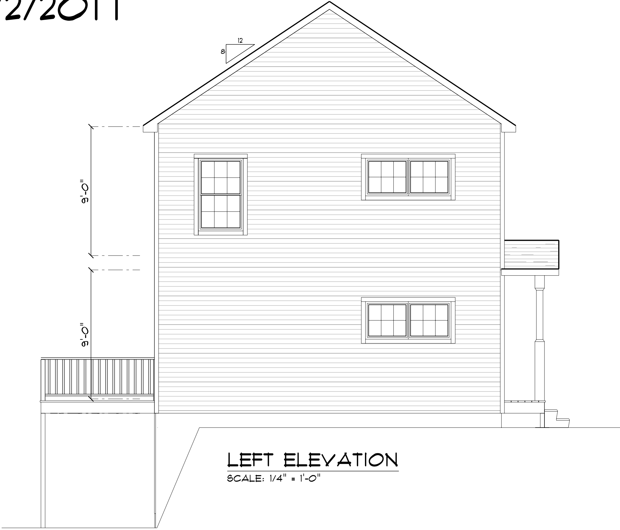
LEFT ELEVATION SCALE: 1/4" = 1'-0"

SPECIFY HEADERS: TYPICAL: 2 FLY 2X10 TO BE VERIFIED/SIZED BY CONTRACTOR, HOMEOWNER, OR STRUCTURAL ENGINEER