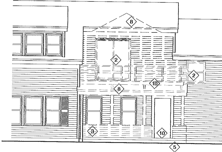
10 Proposed Elevation