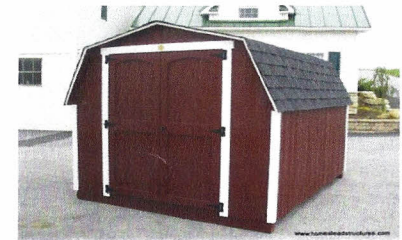
Low Side Gambrel

Family Owned and Operated for 35+ Years, 3rd Generation!