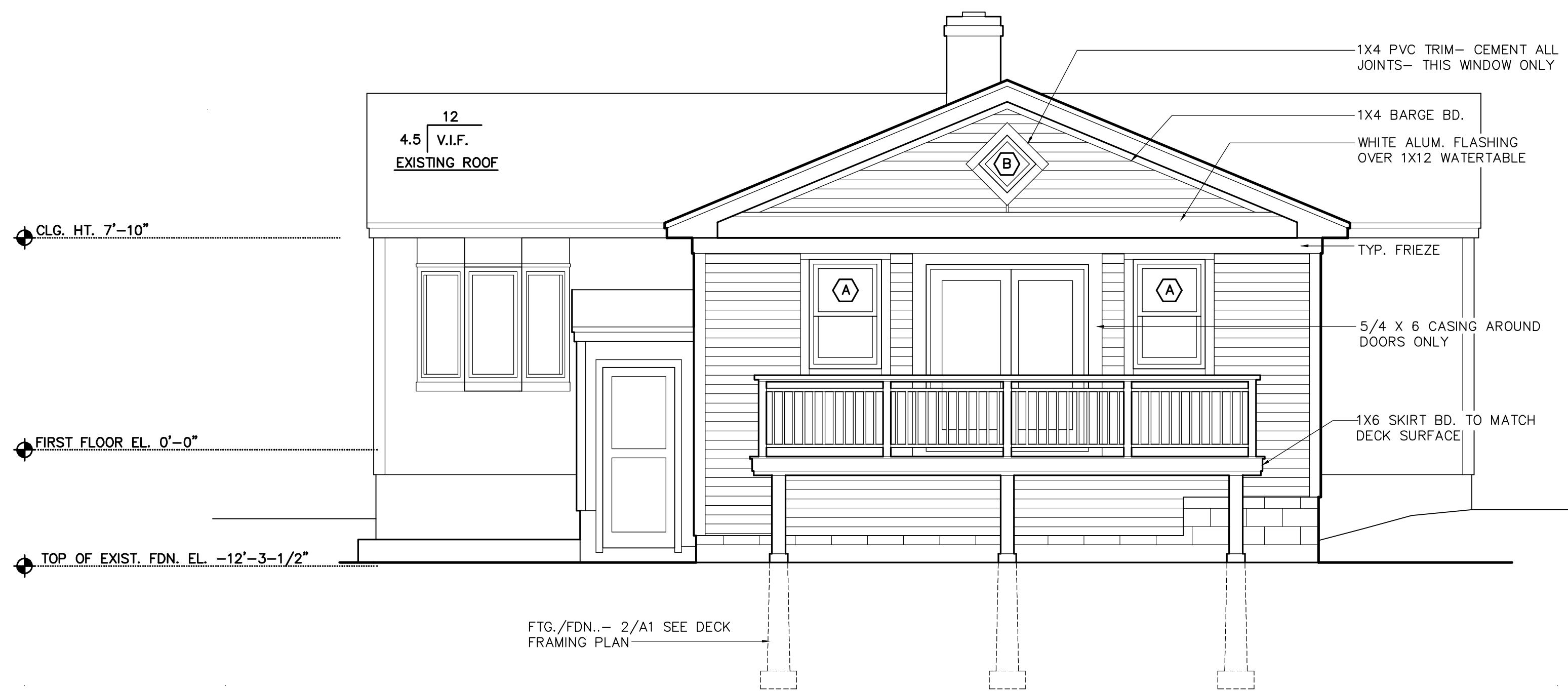
03 SOUTH ELEVATION scale: 1/4" = 1'-0"