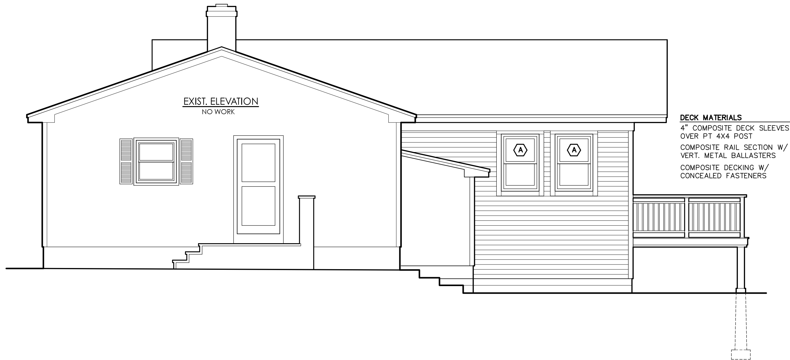
01 WEST ELEVATION scale: 1/4" = 1'-0"