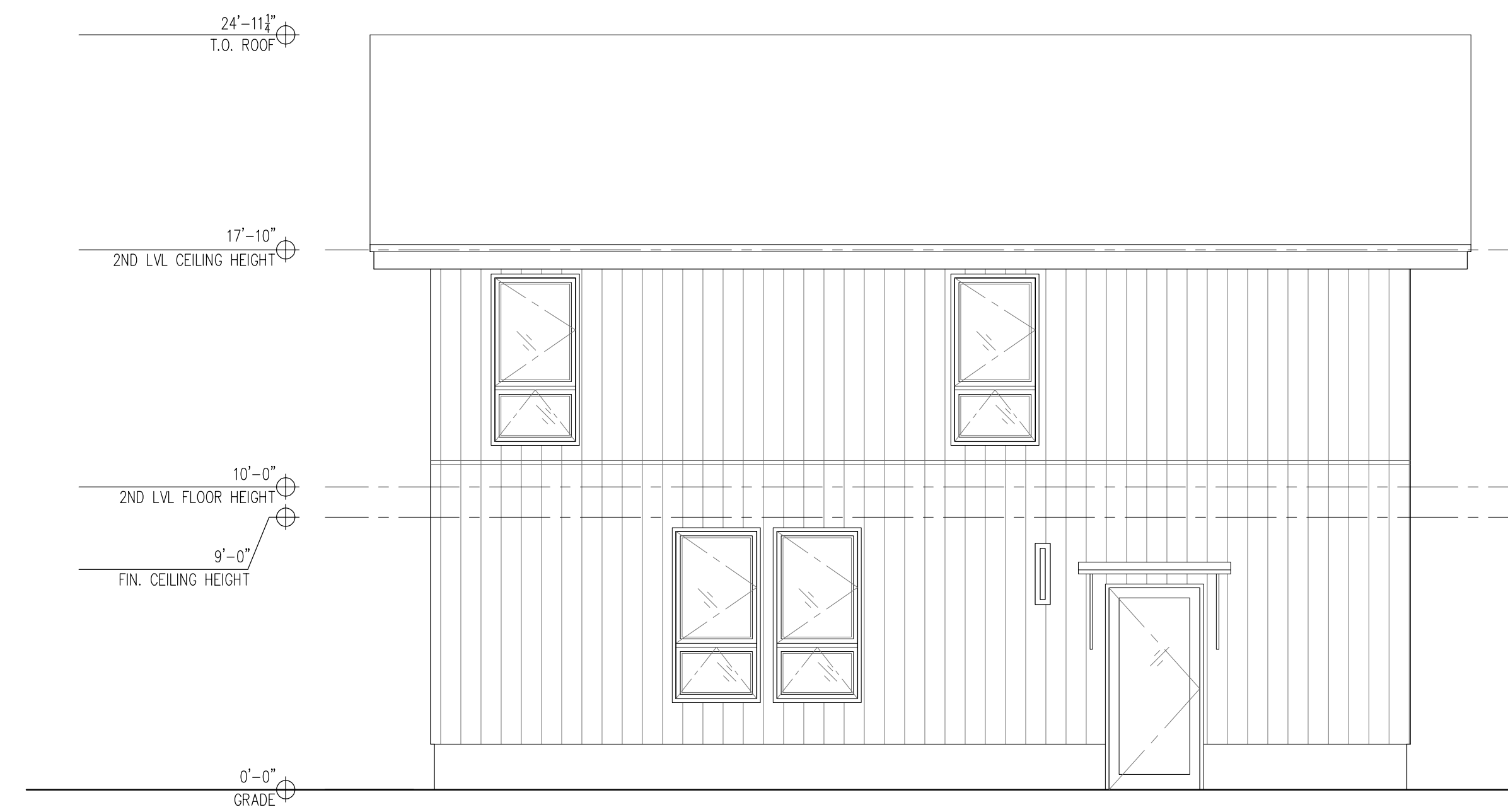
1 | SOUTH ELEVATION SCALE: 1/4"=1'-0"