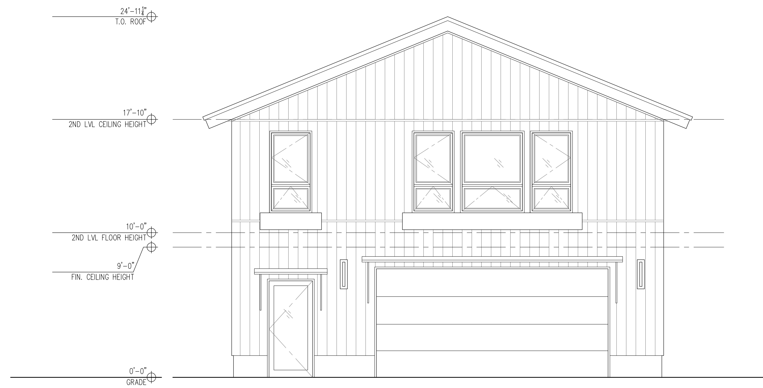
2 | WEST ELEVATION SCALE: 1/4"=1'-0"