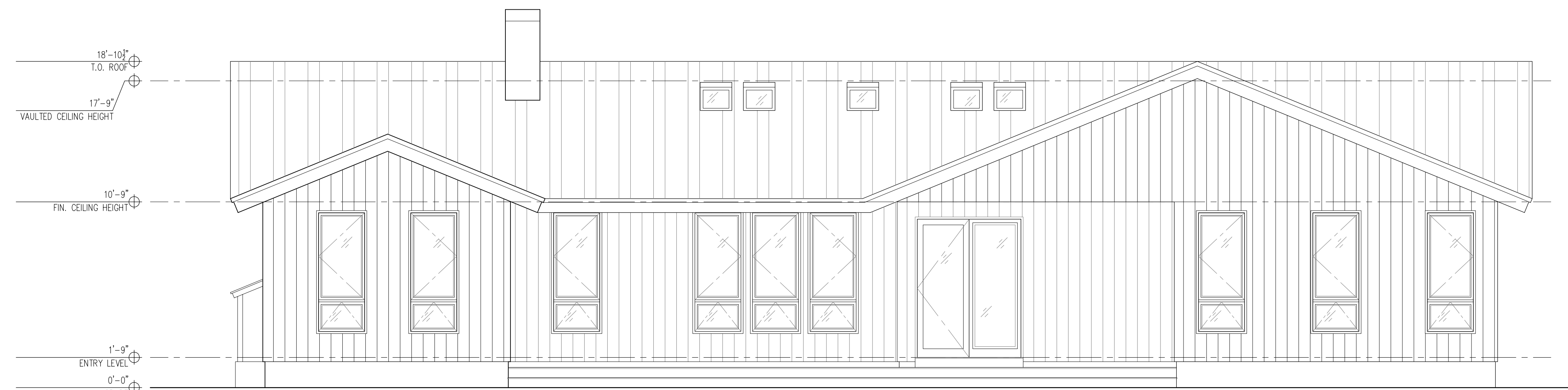
1 | SOUTH ELEVATION SCALE: 1/4"=1'-0"