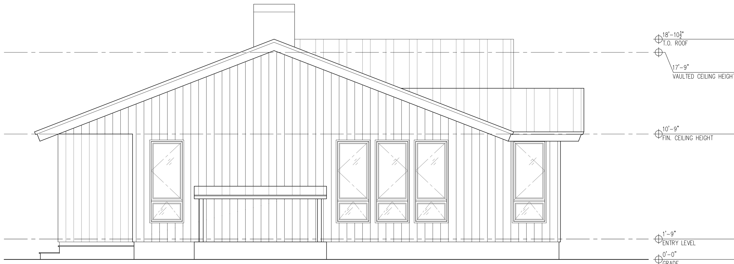
2 | WEST ELEVATION SCALE: 1/4"=1'-0"