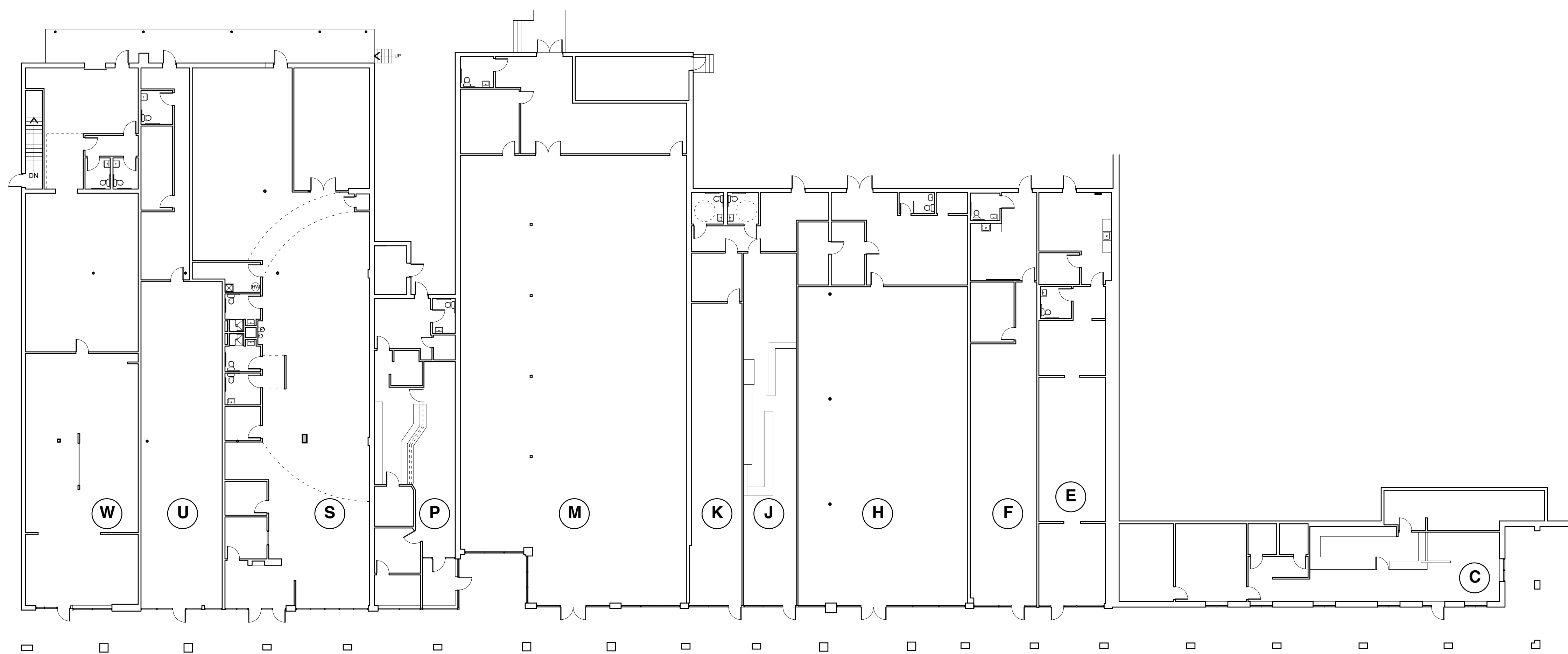
1 GROUND FLOOR PLAN SCALE: 1/16" = 1'-0" 4' 8' 16' 32'

NOTE: PLAN IS BASED ON FIELD MEASUREMENT OF SELECTED EXISTING CONDITIONS AND COMPILATION OF TENANT FIT-UP PLANS, AND MAY NOT REFLECT CURRENT CONDITIONS. VERIFY EXISTING DIMENSIONS AND CONDITIONS IN THE FIELD BEFORE BEGINNING ANY WORK ON THE BUILDING.