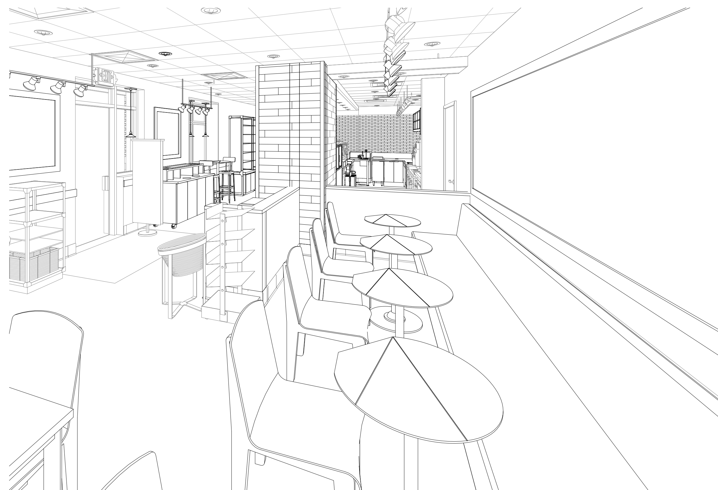
3 PERSPECTIVE VIEW @ BANQUETTE Scale: