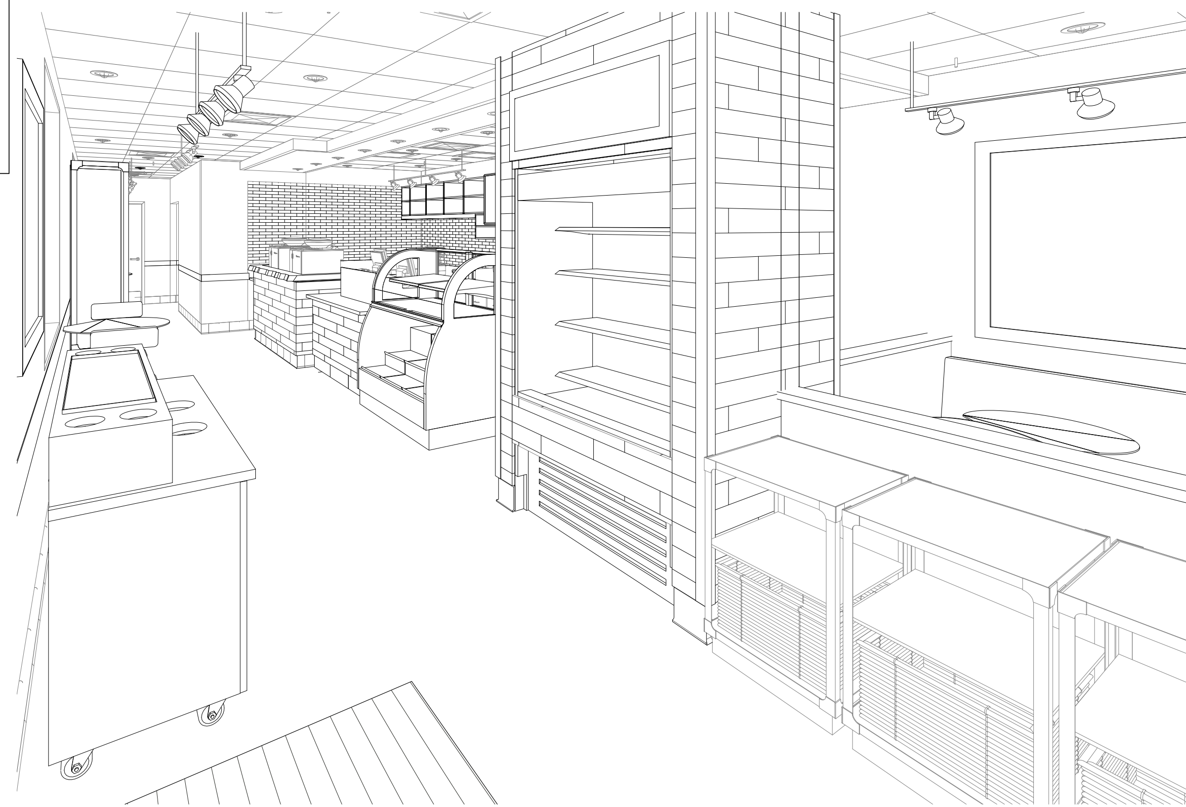
1 PERSPECTIVE VIEW @ ENTRANCE Scale: