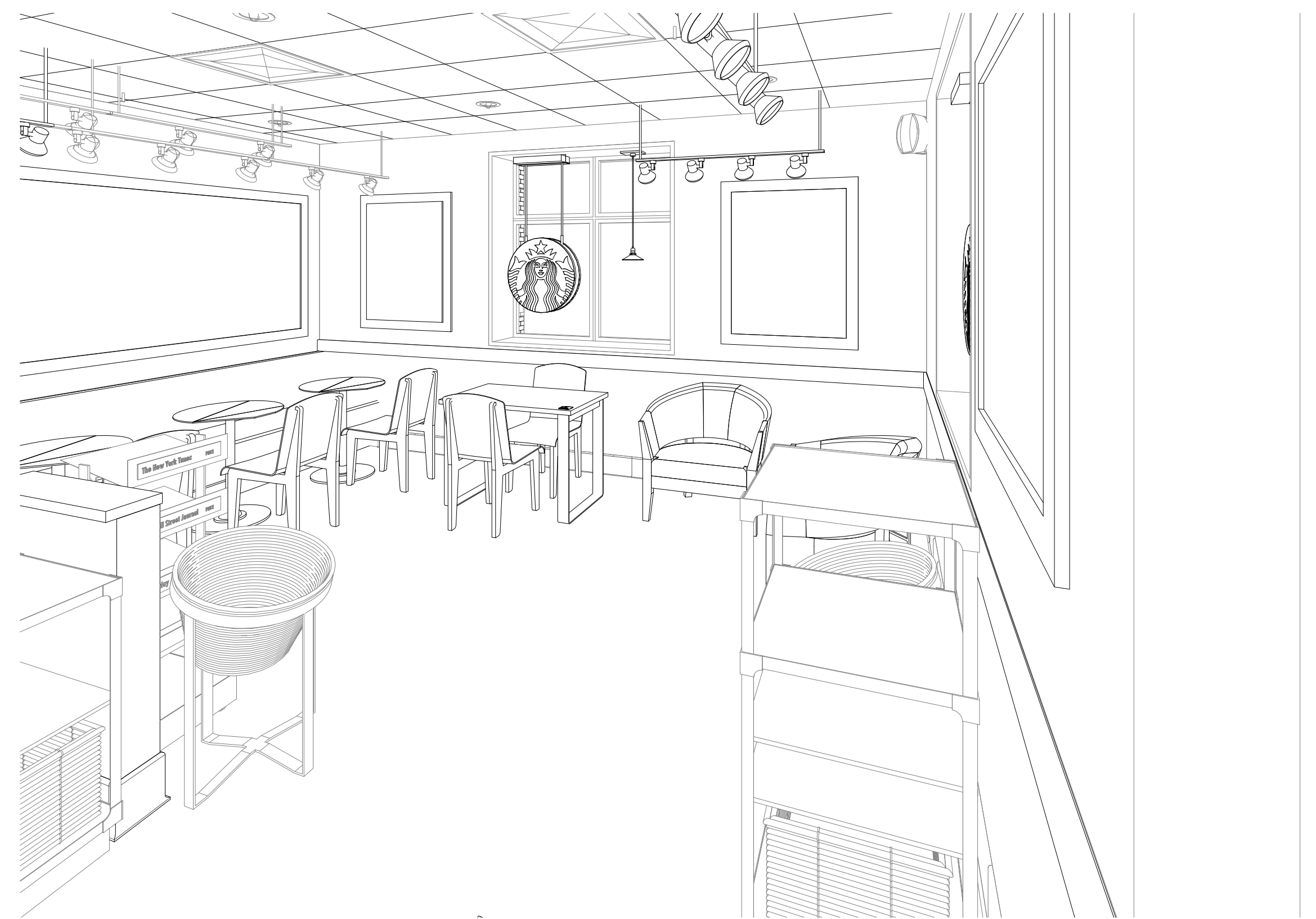
2 PERSPECTIVE VIEW @ CAFE SEATING Scale: