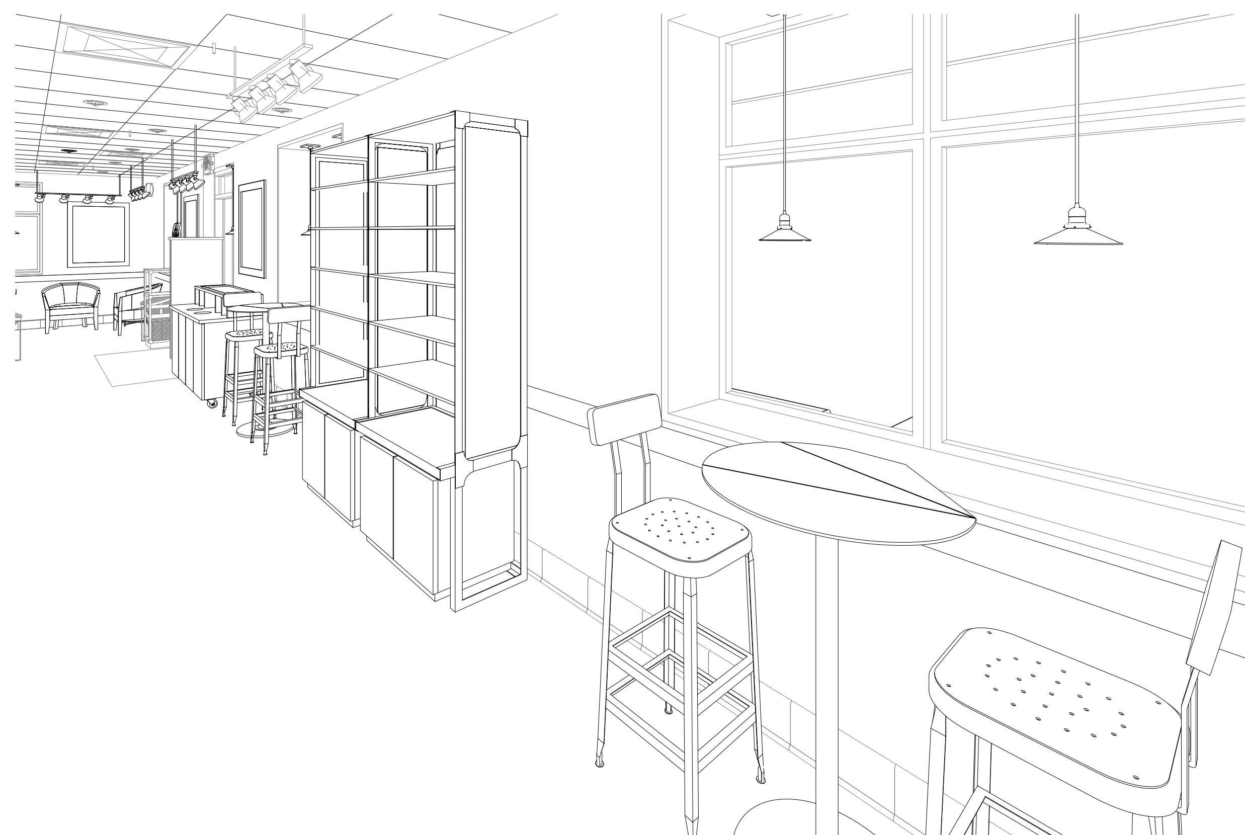
4 PERSPECTIVE VIEW @ BAR HEIGHT SEATING Scale: