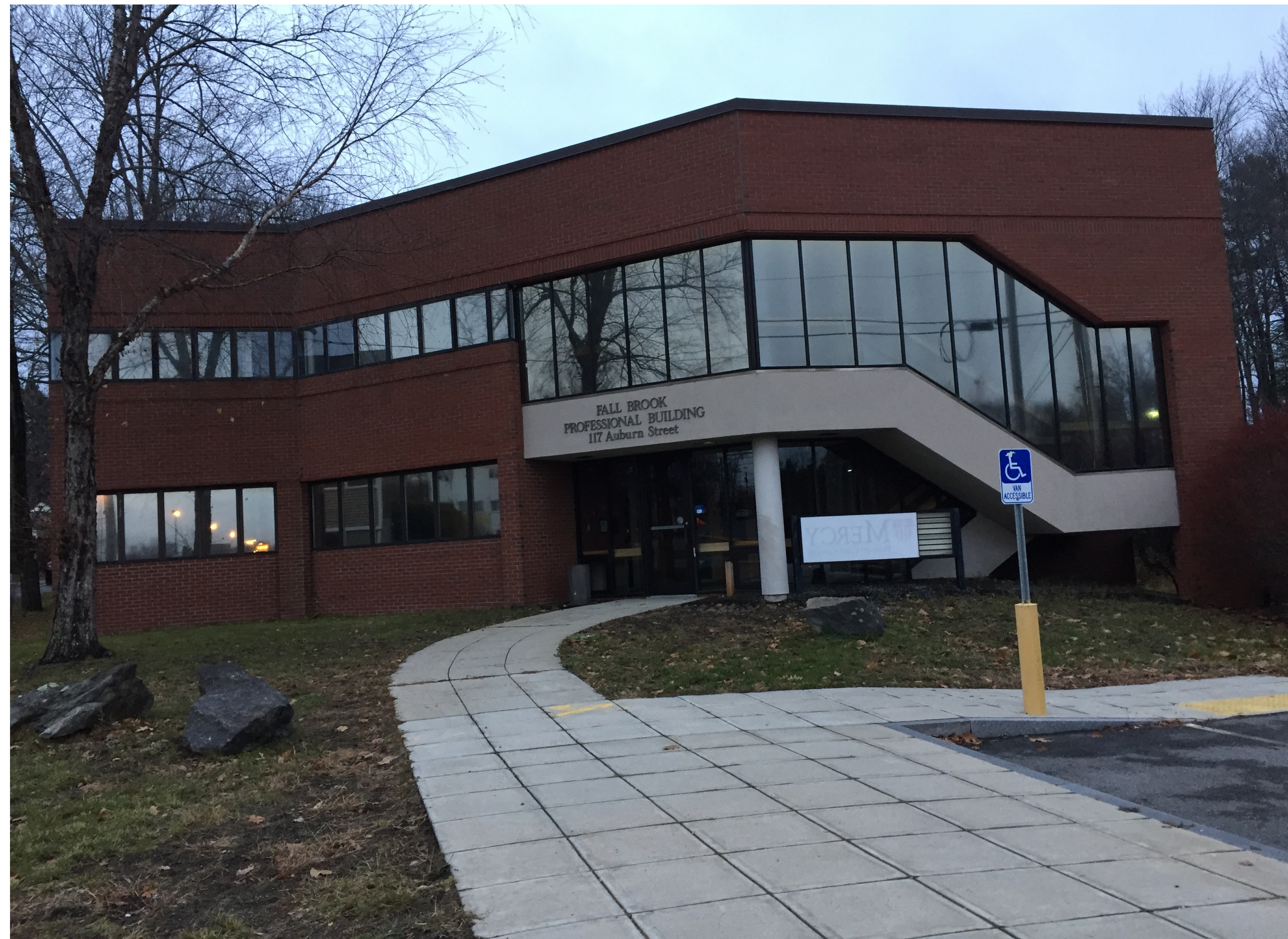
1 117 AUBURN STREET EXISTING EXTERIOR ELEVATION S1.0