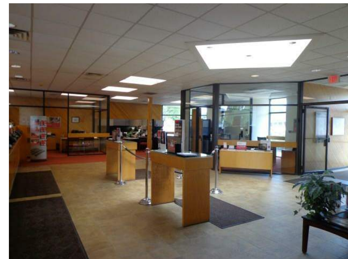
LOBBY FURNITURE TO BE REPLACED