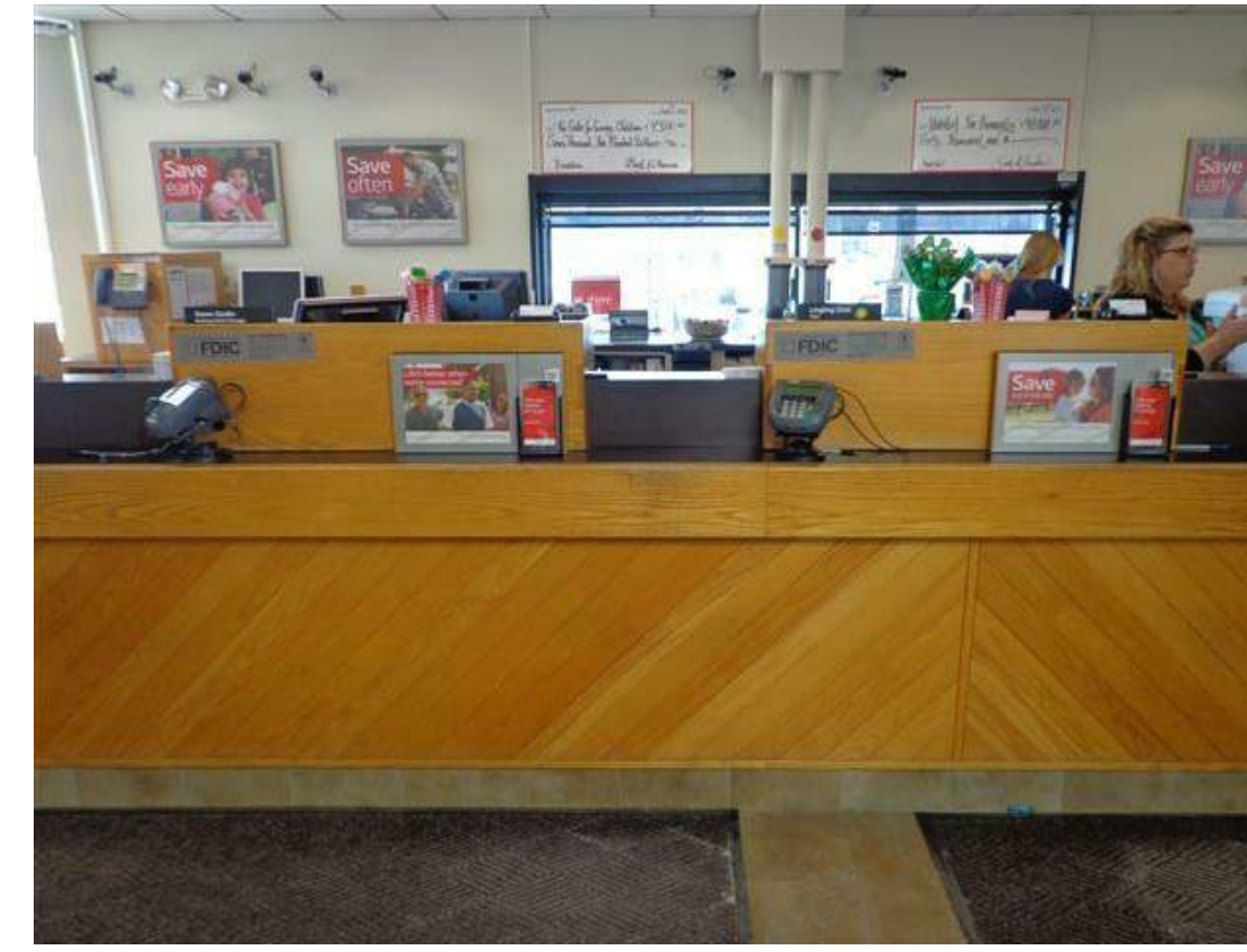
TELLER STATION TO BE MADE ADA COMPLIANT