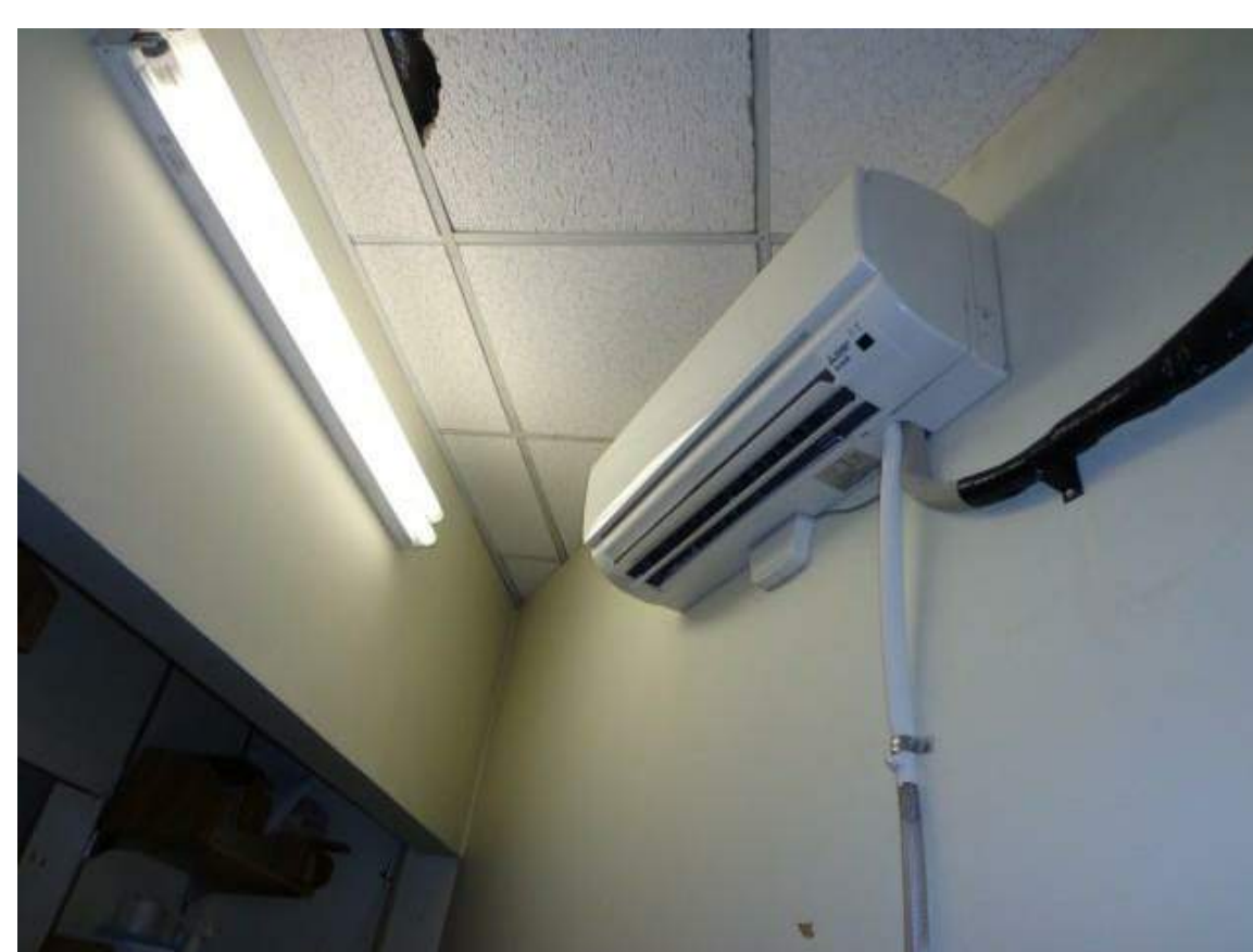
ATM ROOM - RELOCATE EXISTING HVAC UNIT.