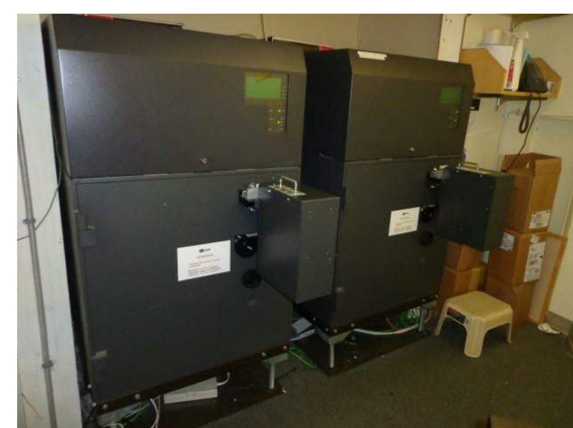
RELOCATE ONE ATM. RELOCATE AND LOWER SECOND ATM TO COMPLY WITH 2010 ADAAG.