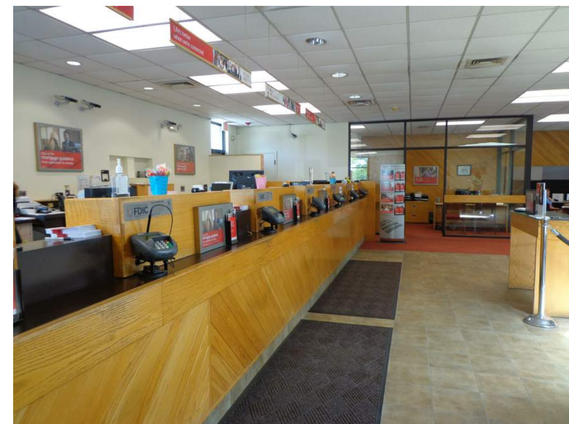
REMOVE NON-COMPLIANT WALK OFF MATS