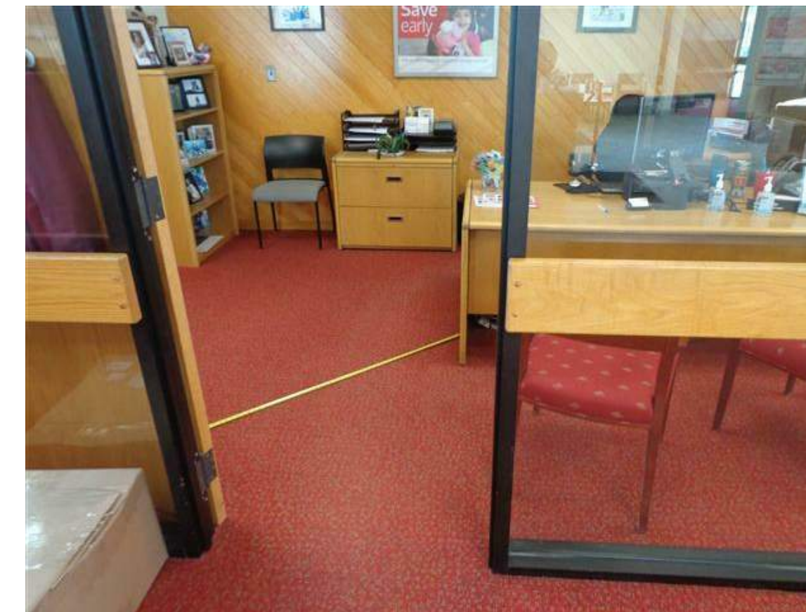
CARPET TO BE REPLACED