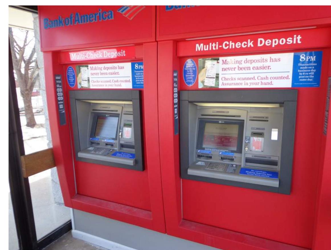
RELOCATE AND RECONFIGURED ATMS. REPLACE EXISTING SURROUNDS.