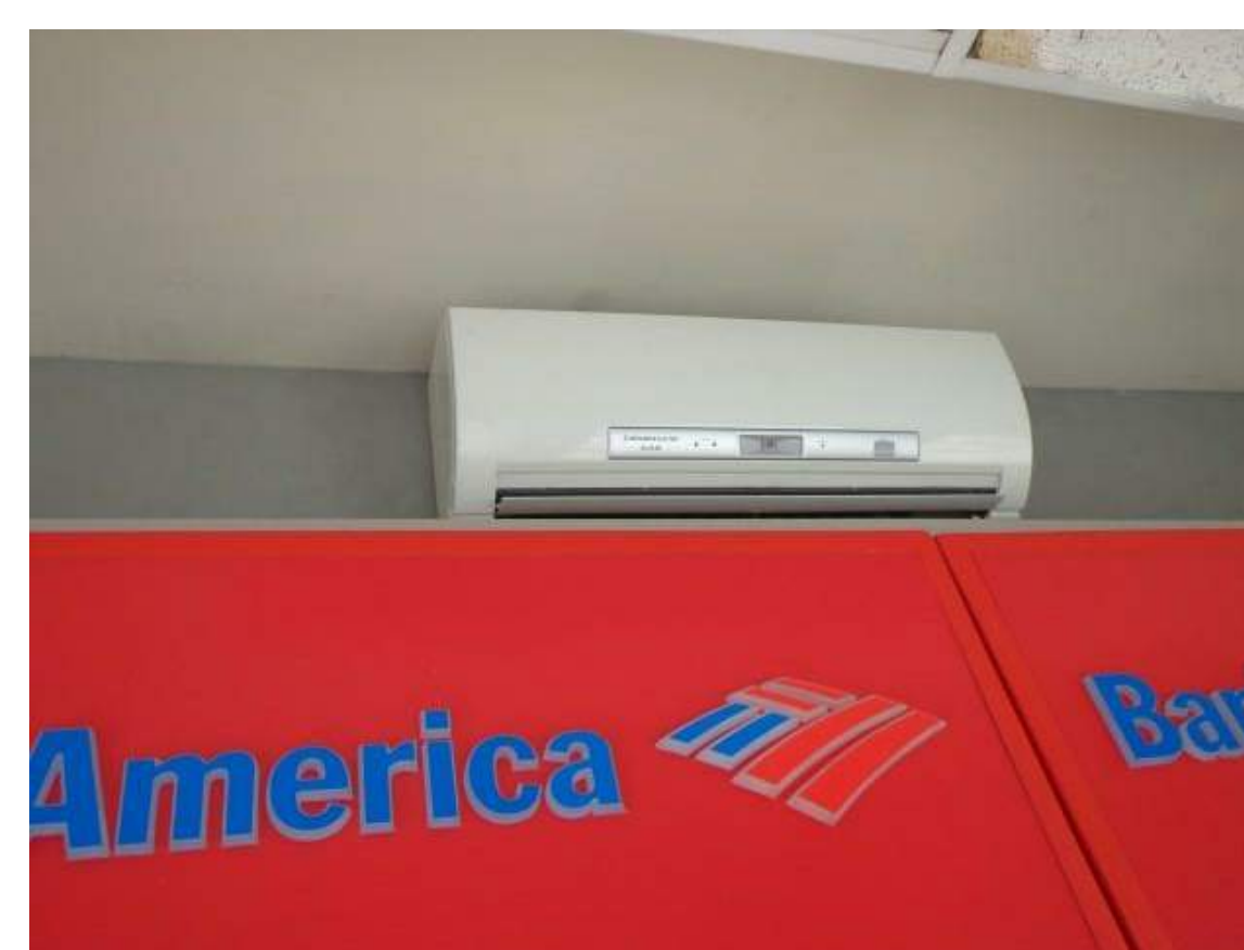
ATM LOBBY - EXISTING HVAC UNIT TO REMAIN.