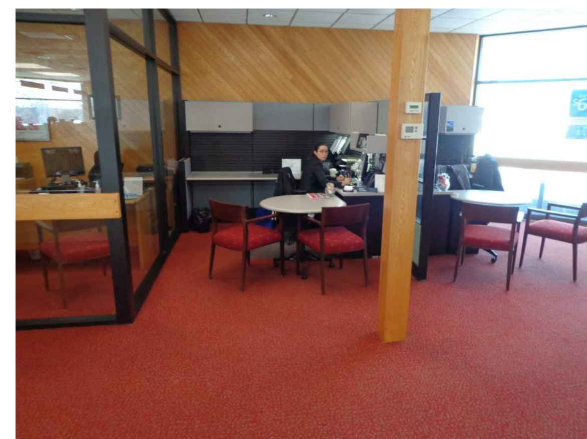
REMOVE & REPLACE FURNITURE AS PART OF CONSOLIDATION CAP ADD PROJECT.