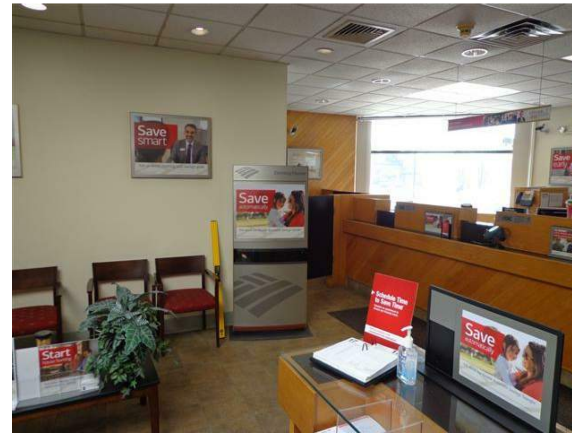
TELLER LINE AND SDV ENTRY TO BE RECONFIGURED FOR NEW ADA TELLER STATION AND VIEWING ROOM