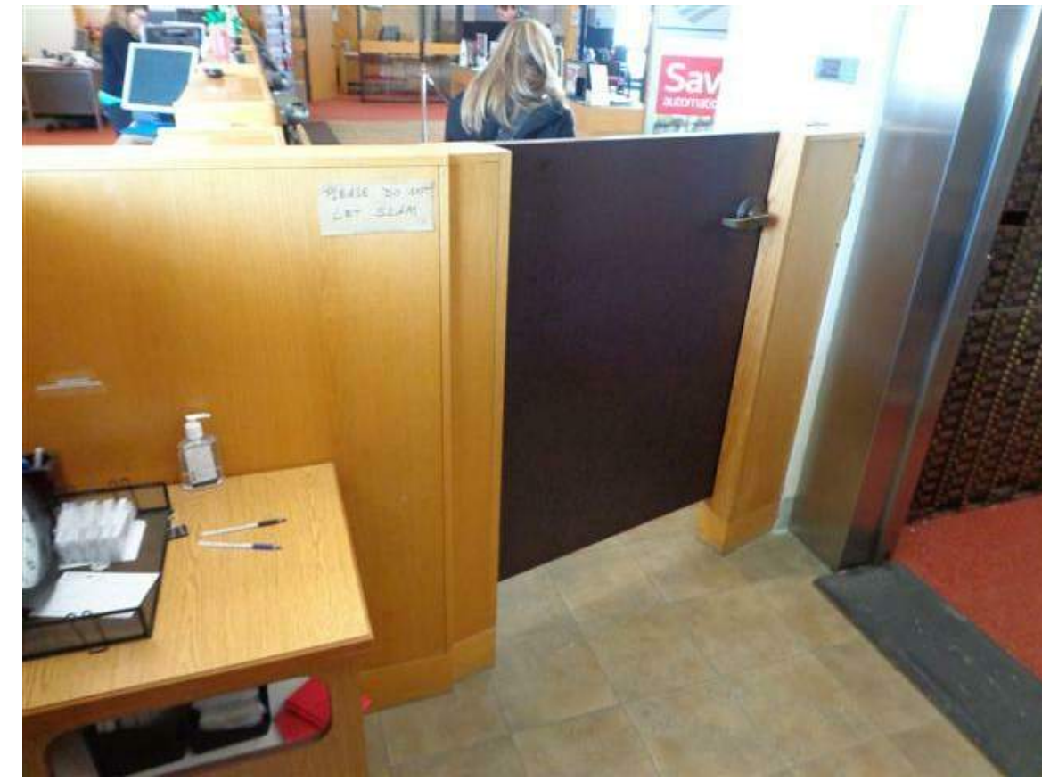
VIEWING ROOM ACCESS TO BE RECONFIGURED