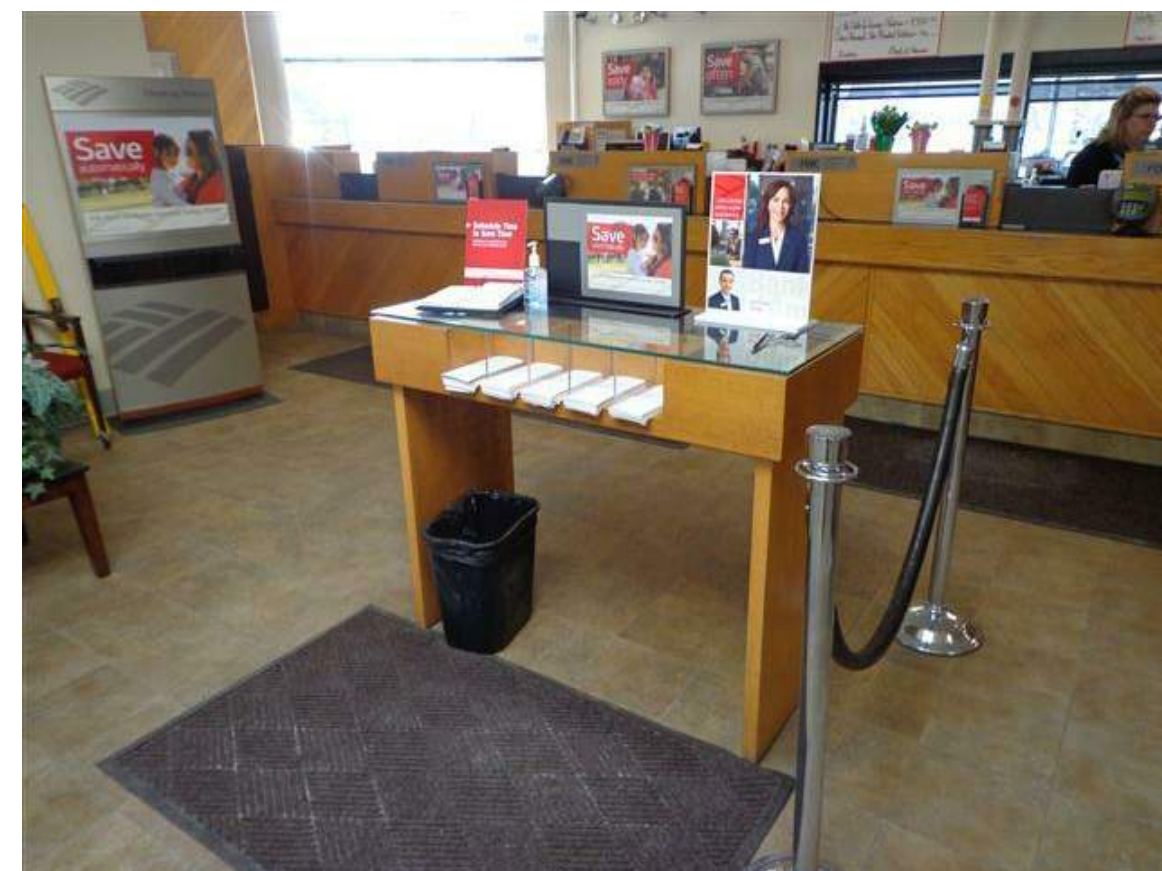
CHECK DESK TO BE REPLACED