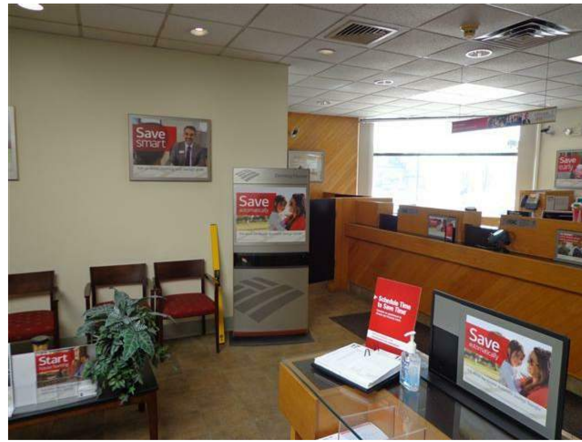
TELLER LINE AND SDV ENTRY TO BE RECONFIGURED FOR NEW ADA TELLER STATION AND VIEWING ROOM