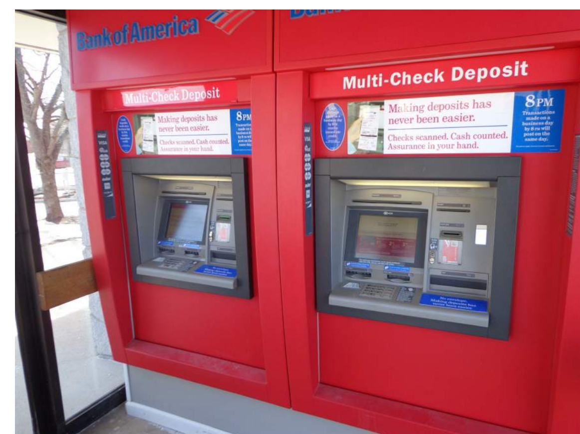
RELOCATE AND RECONFIGURED ATMS. REPLACE EXISTING SURROUNDS.