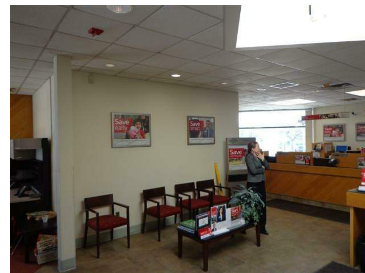
REMOVE & REPLACE FURNITURE AS PART OF CONSOLIDATION CAP ADD PROJECT.