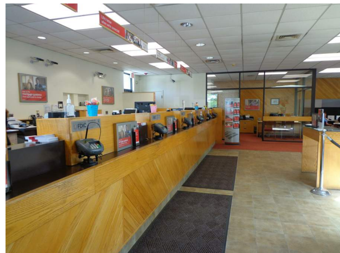
REMOVE NON-COMPLIANT WALK OFF MATS