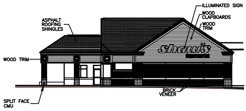
SOUTH ELEVATION 3/32"=1'-0"