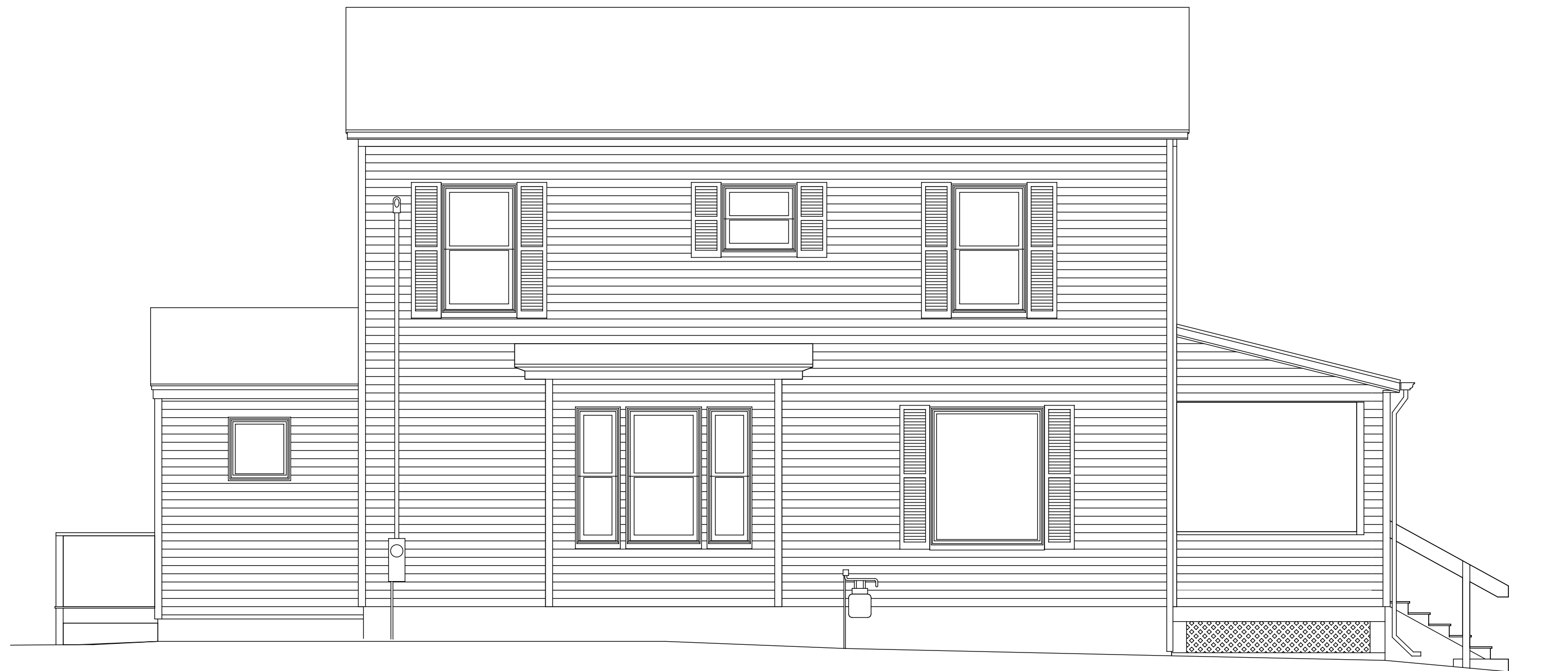
4 NORTHWEST ELEVATION SCALE: 1/4" = 1'-0"