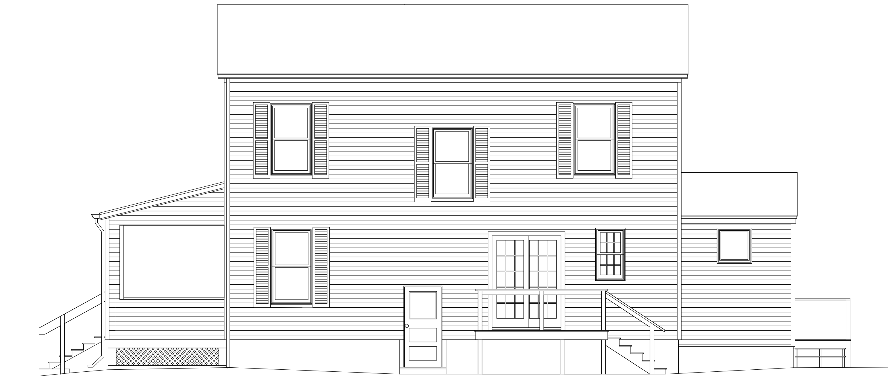
2 SOUTHEAST ELEVATION SCALE: 1/4" = 1'-0"