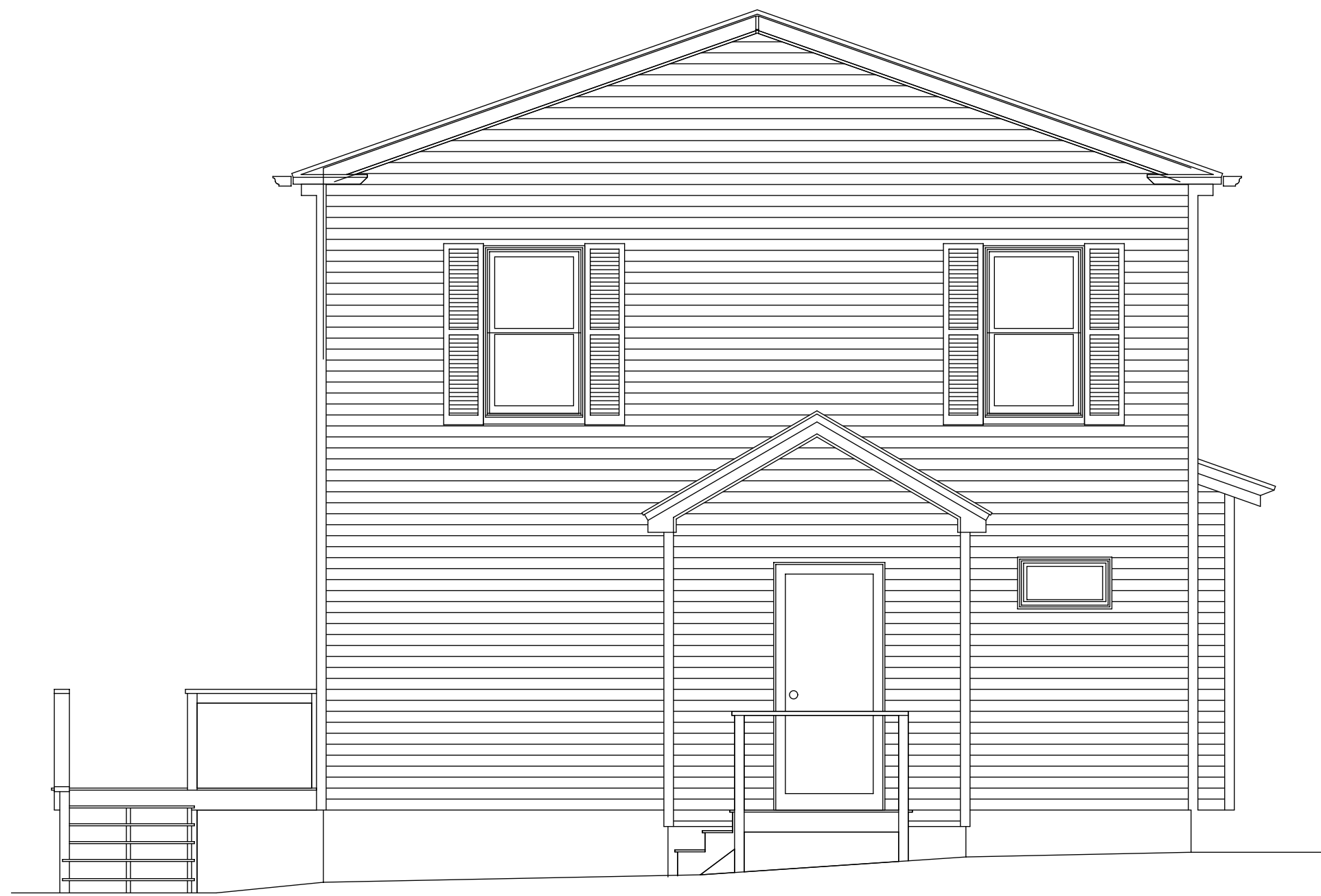
3 NORTHEAST ELEVATION SCALE: 1/4" = 1'-0"