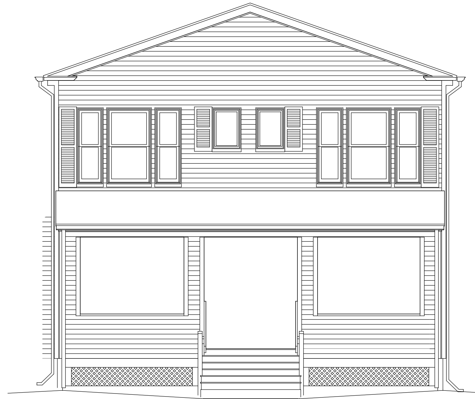
1 SOUTHWEST ELEVATION SCALE: 1/4" = 1'-0"