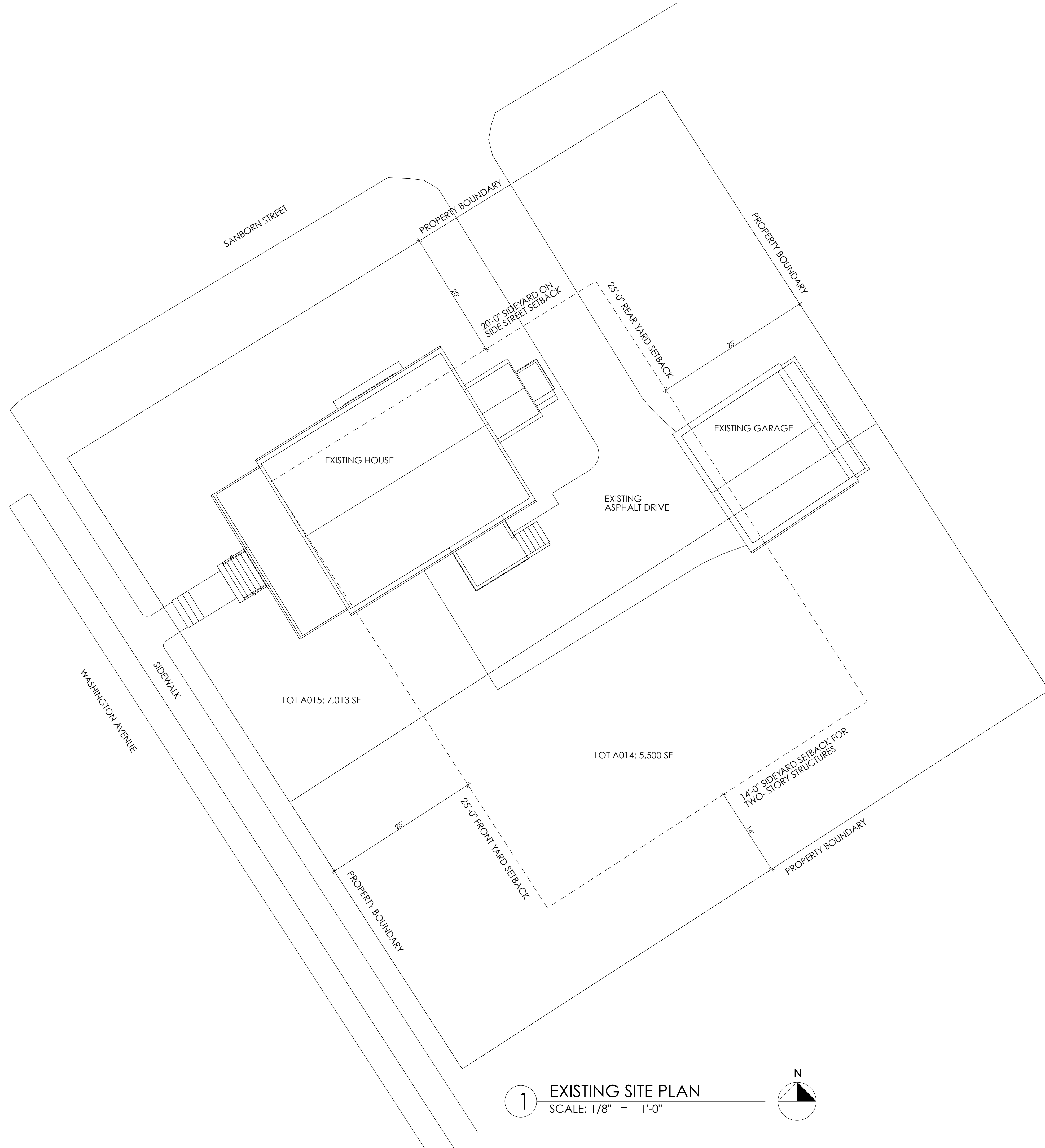
1 EXISTING SITE PLAN SCALE: 1/8" = 1'-0"