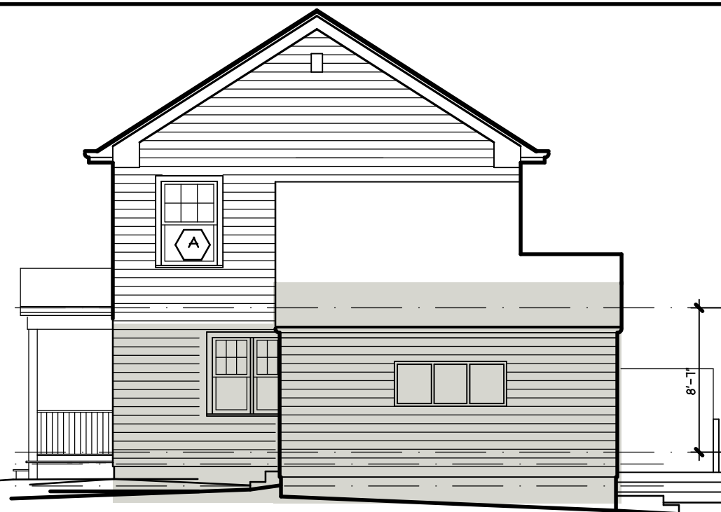
(F) PROPOSED SE ELEVATION