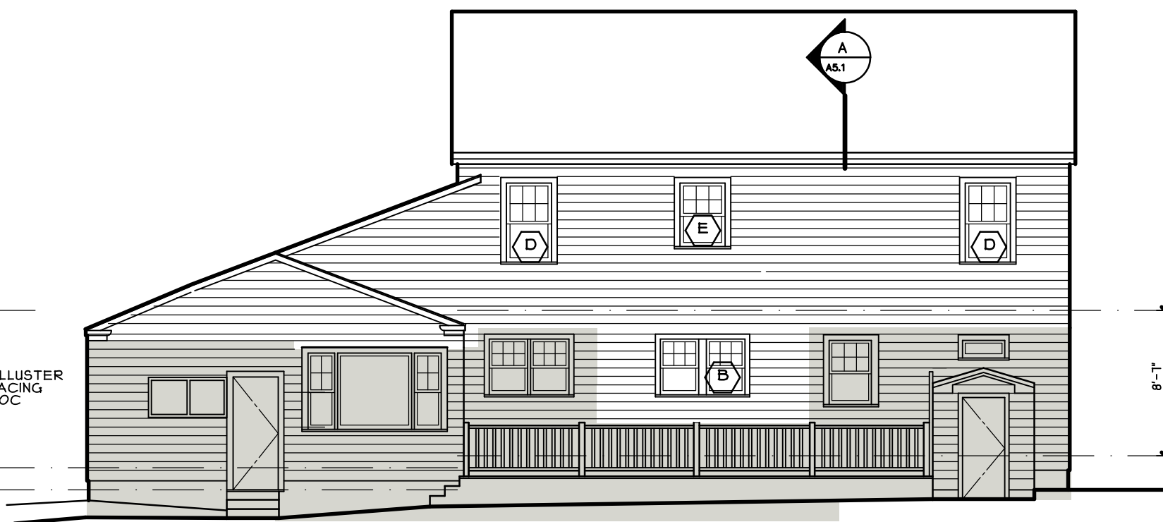
(H) PROPOSED SE ELEVATION