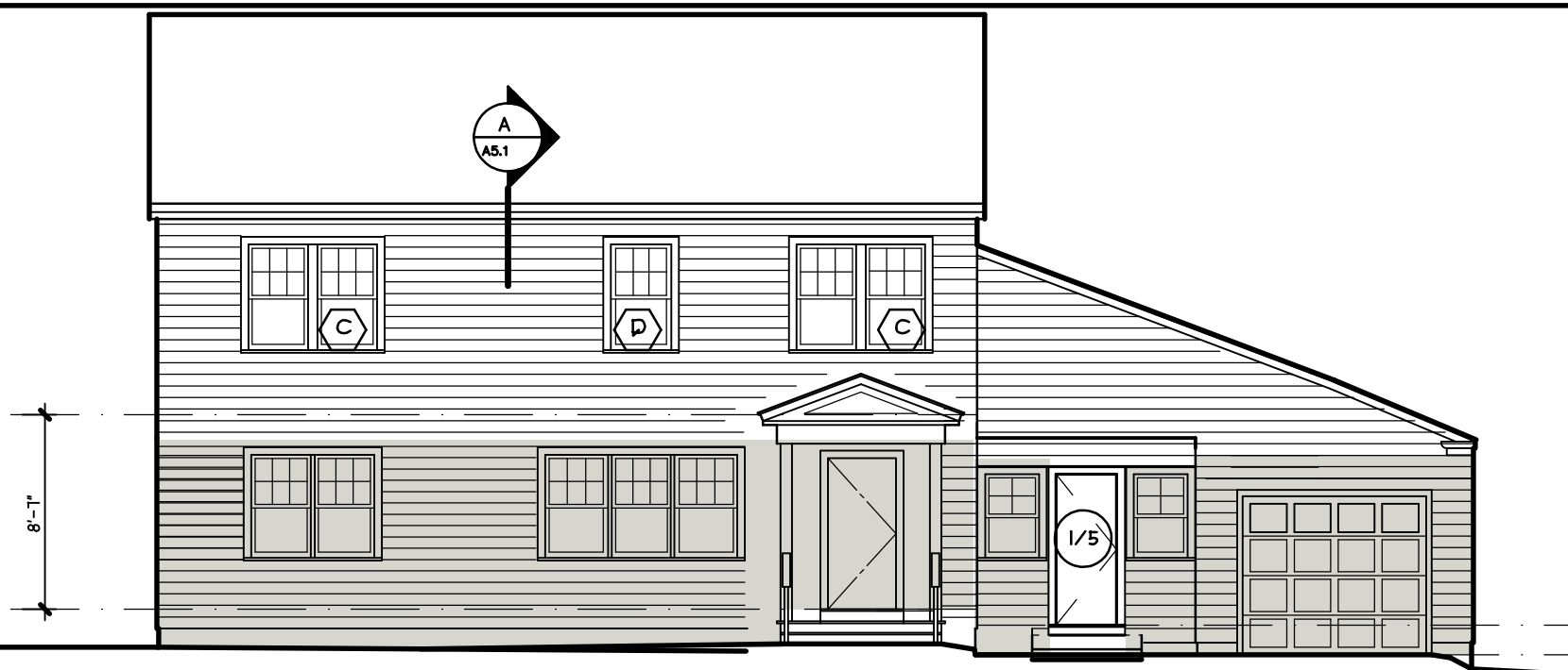
(E) PROPOSED SW ELEVATION