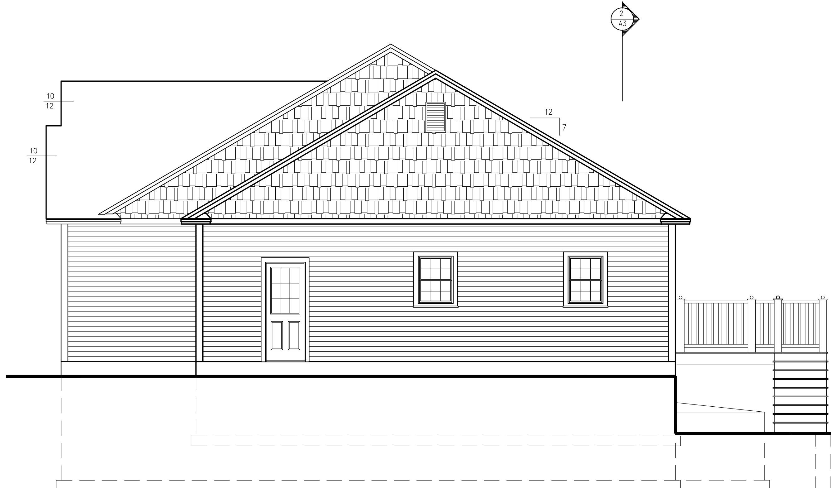
RIGHT SIDE ELEVATION 1/4" = 1'-0"