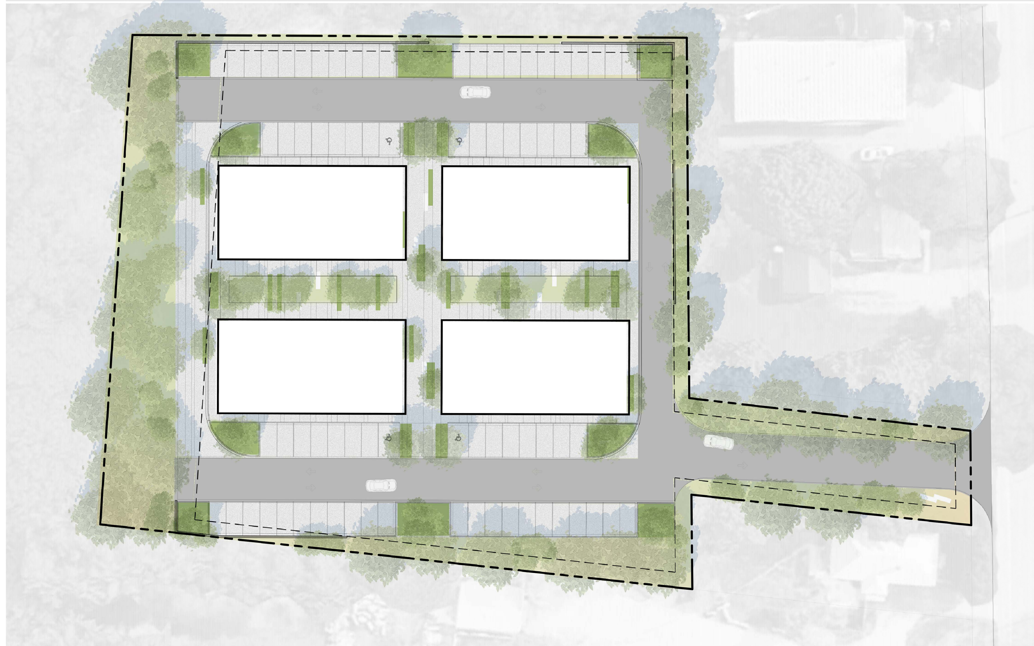
ILLUSTRATIVE CONCEPT PLAN (NTS)

02.07.2018 PRELIMINARY SITE PLAN SUBMITTAL