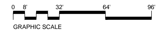
1 SITE PLAN/ROOF PLAN SCALE: 1/32" = 1'-0"