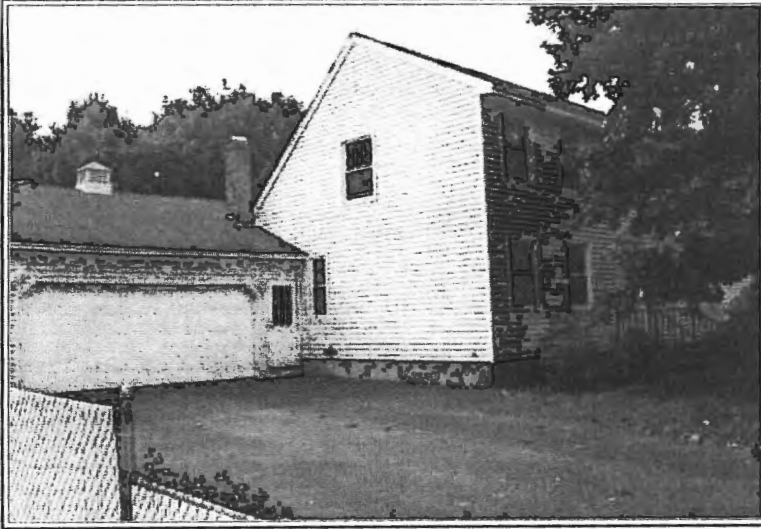
FRONT OF SUBJECT PROPERTY 80 Regan Lane Portland, ME 04103