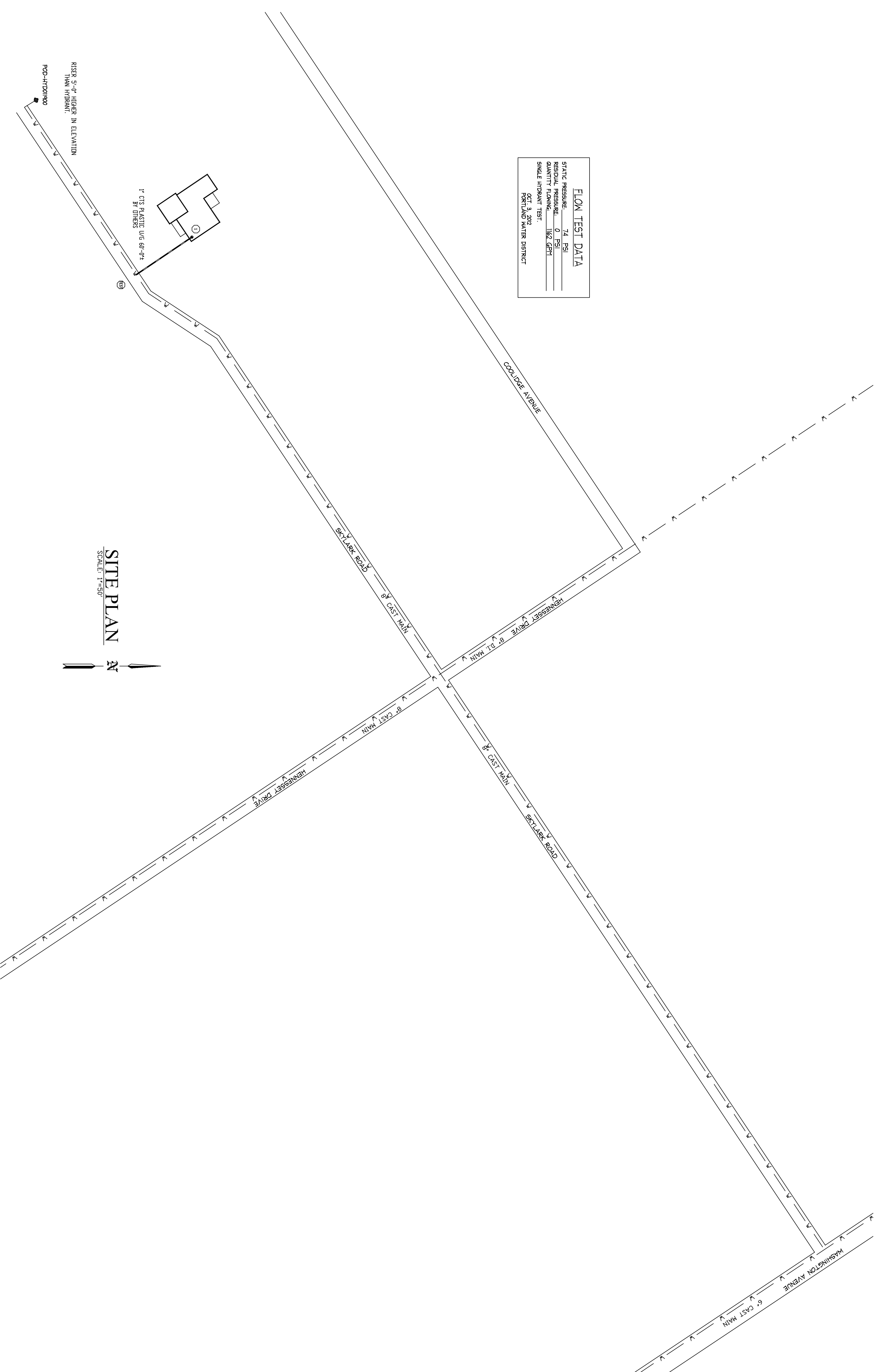
SITE PLAN SCALE: 1/8"=1'-0"