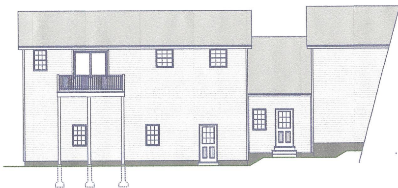
Rear Elevation 1/8" = 1'-0"