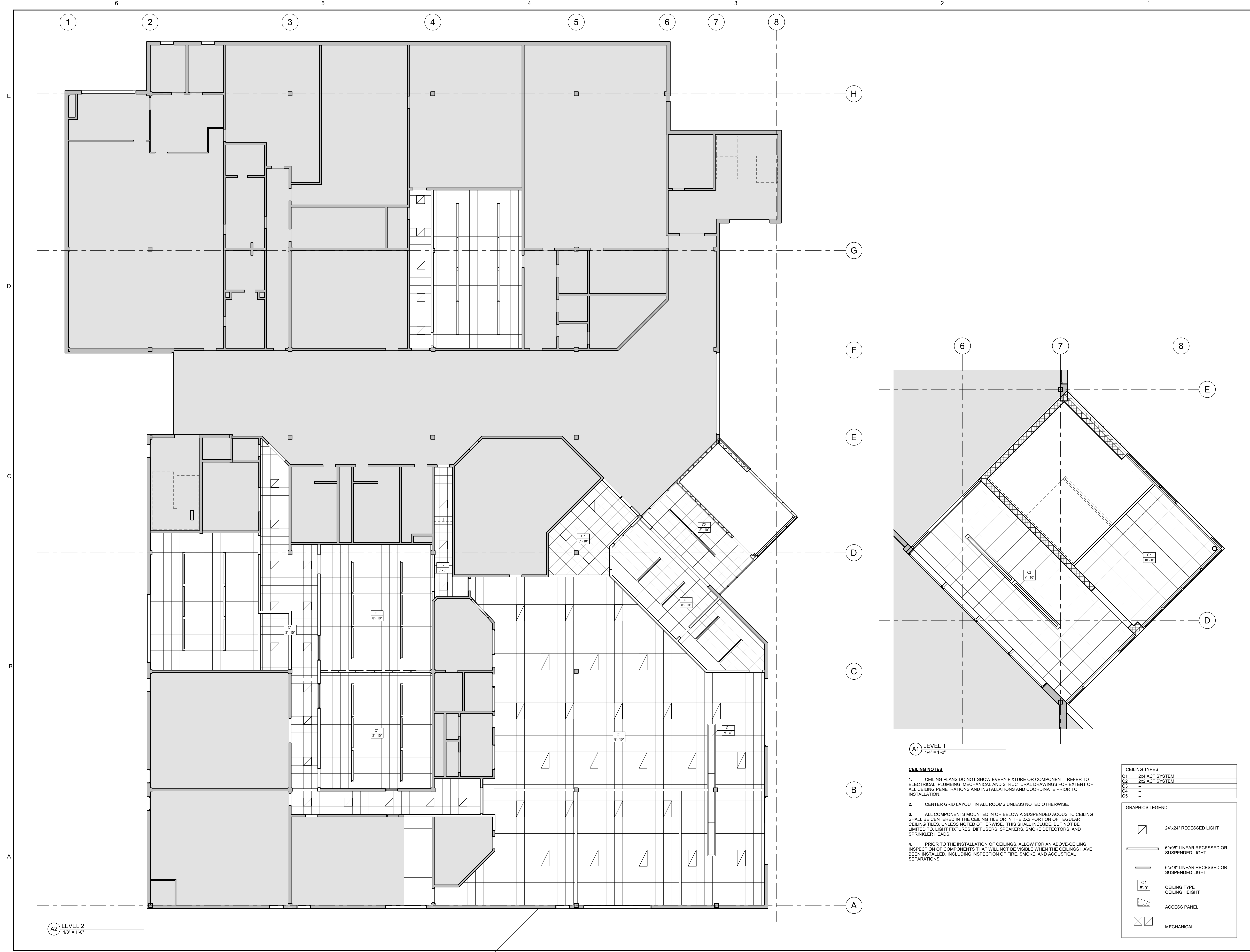
A1 LEVEL 1 1/4" = 1'-0"