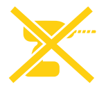
No Cutting or Drilling