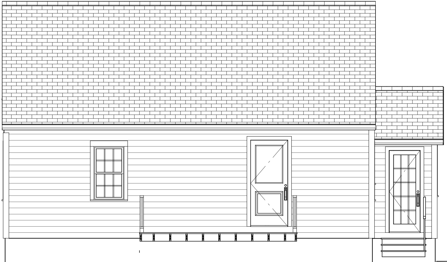
Existing Elevation Back