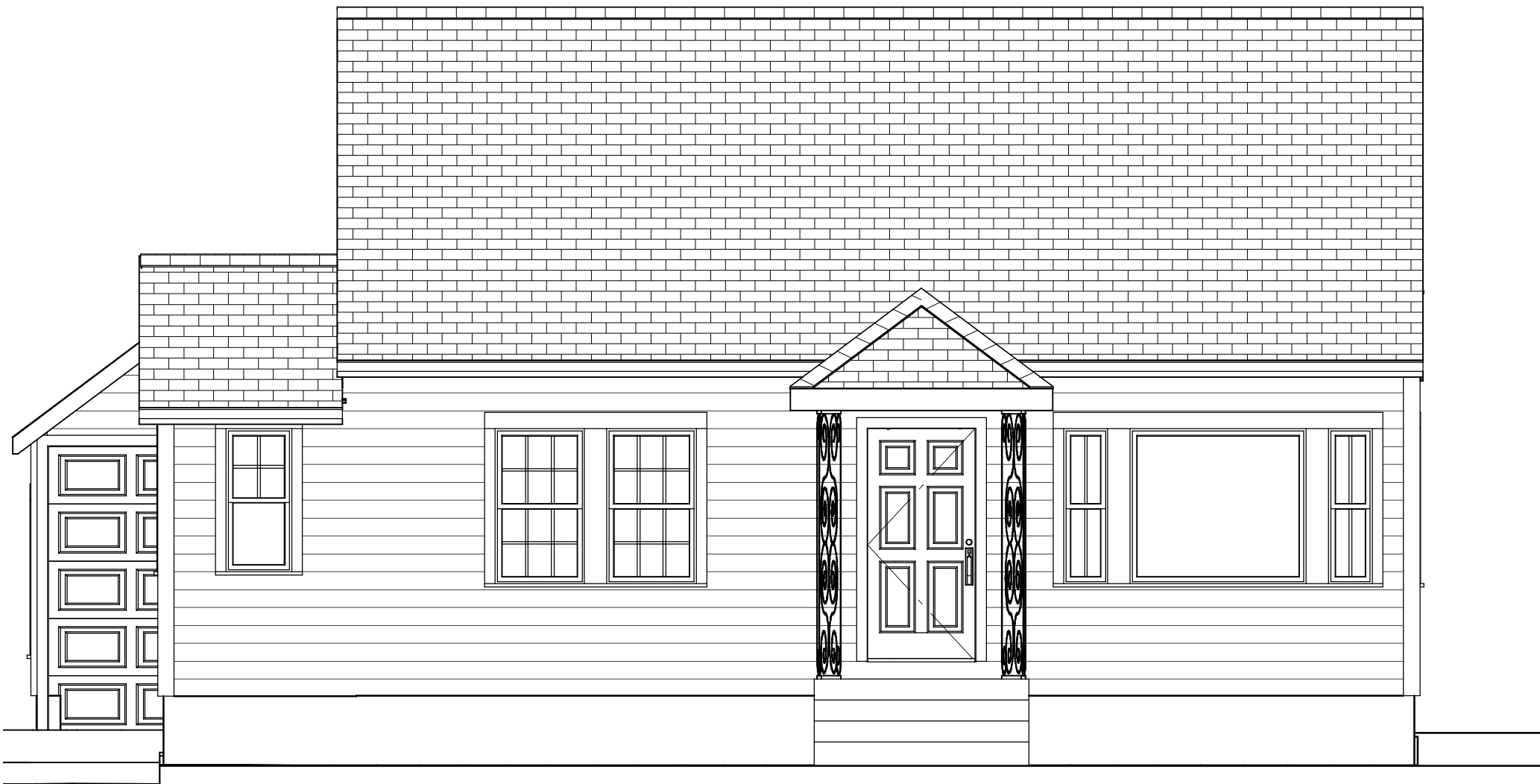
Existing Elevation Front