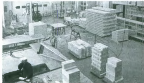
Our manufacturing facility is modern, efficient and climate controlled.

O ur price includes delivery and installation within 50 miles. We supply all concrete blocks for leveling. Outside of our free delivery range? We will deliver to most New England locations for $3.00/mi. after the first 50 miles from our store.