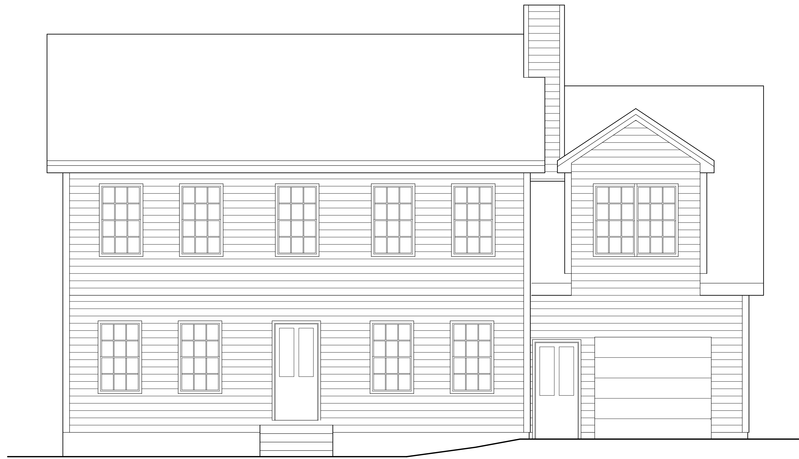
A FRONT ELEVATION Scale: 1/4" = 1'-0"