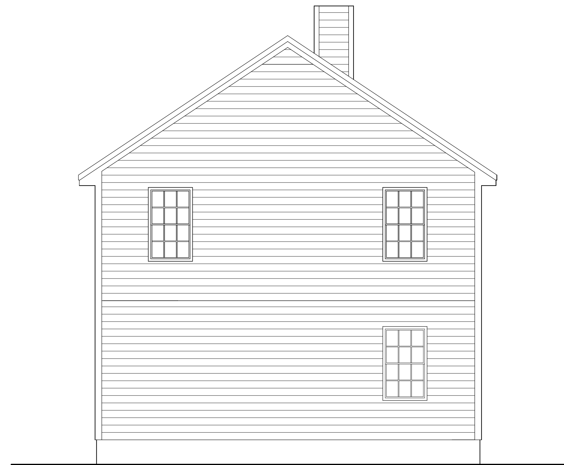
A LEFT SIDE ELEVATION Scale: 1/4" = 1'-0"

NOTE: THIS DRAWING IS PROVIDED FOR INFORMATIONAL PURPOSES ONLY. IF USED FOR CONSTRUCTION, THE CONTRACTOR ASSUMES ALL RESPONSIBILITY FOR LOCAL CODE COMPLIANCE. ALL DRAWINGS, PLANS, SKETCHES, ETC. ARE PROVIDED TO OUR CLIENTS BASED UPON INFORMATION PROVIDED BY THE CLIENT AND DRAINED IN ACCORDANCE WITH COMMON BUILDING PRACTICES AND LOCAL CODES. NONE OF THE EMPLOYEES OF FMC CADD DRAFTING SERVICES, INC. ARE REGISTERED ARCHITECTS, ENGINEERS OR LAND SURVEYORS. ALL DIMENSIONS AND SPECIFICATIONS SHOULD BE VERIFIED BY CLIENT AND/OR CONTRACTOR BEFORE ACTUAL CONSTRUCTION BEGINS. IF DIMENSIONS AND SPECIFICATIONS ARE NOT VERIFIED BY CLIENT AND/OR CONTRACTOR BEFORE ACTUAL CONSTRUCTION BEGINS FMC CADD DRAFTING SERVICES, INC. WILL BE HELD HARMLESS. FMC CADD DRAFTING SERVICES, INC. ASSUMES NO LIABILITY FOR CHANGES AND/OR REVISIONS MADE TO PLANS BY CLIENT AND/OR CONTRACTOR.