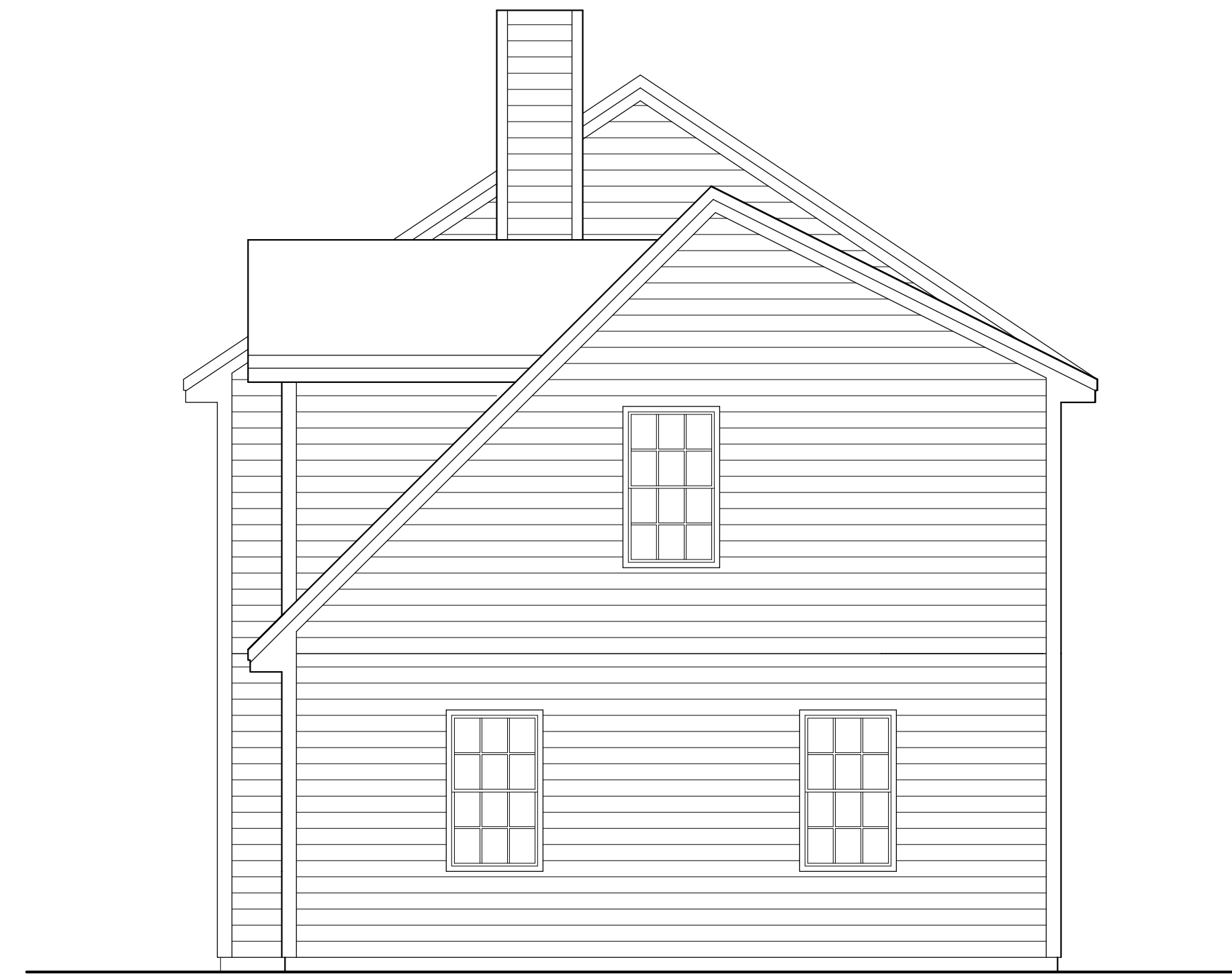
A RIGHT SIDE ELEVATION Scale: 1/4" = 1'-0"