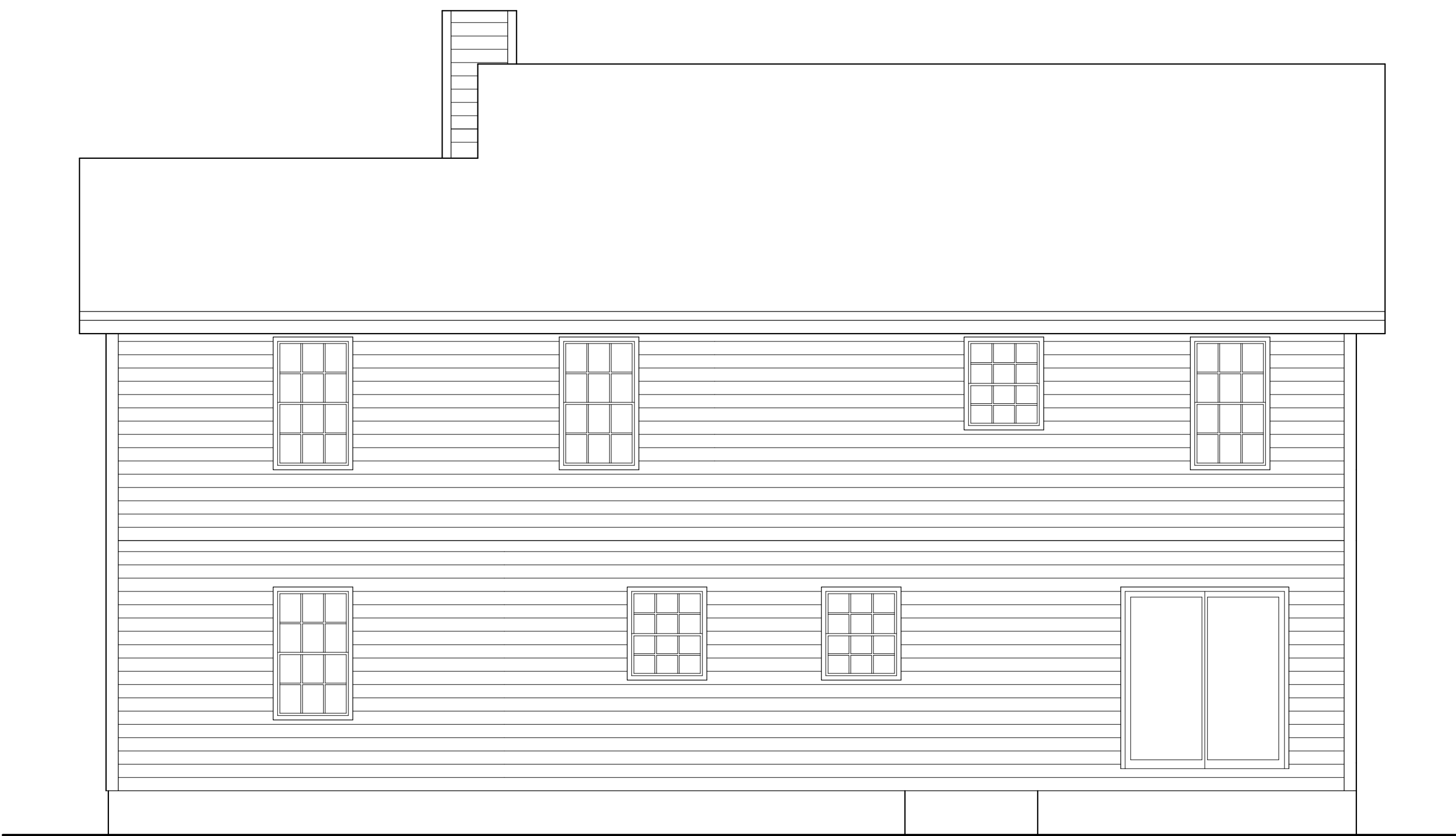
A REAR ELEVATION Scale: 1/4" = 1'-0"