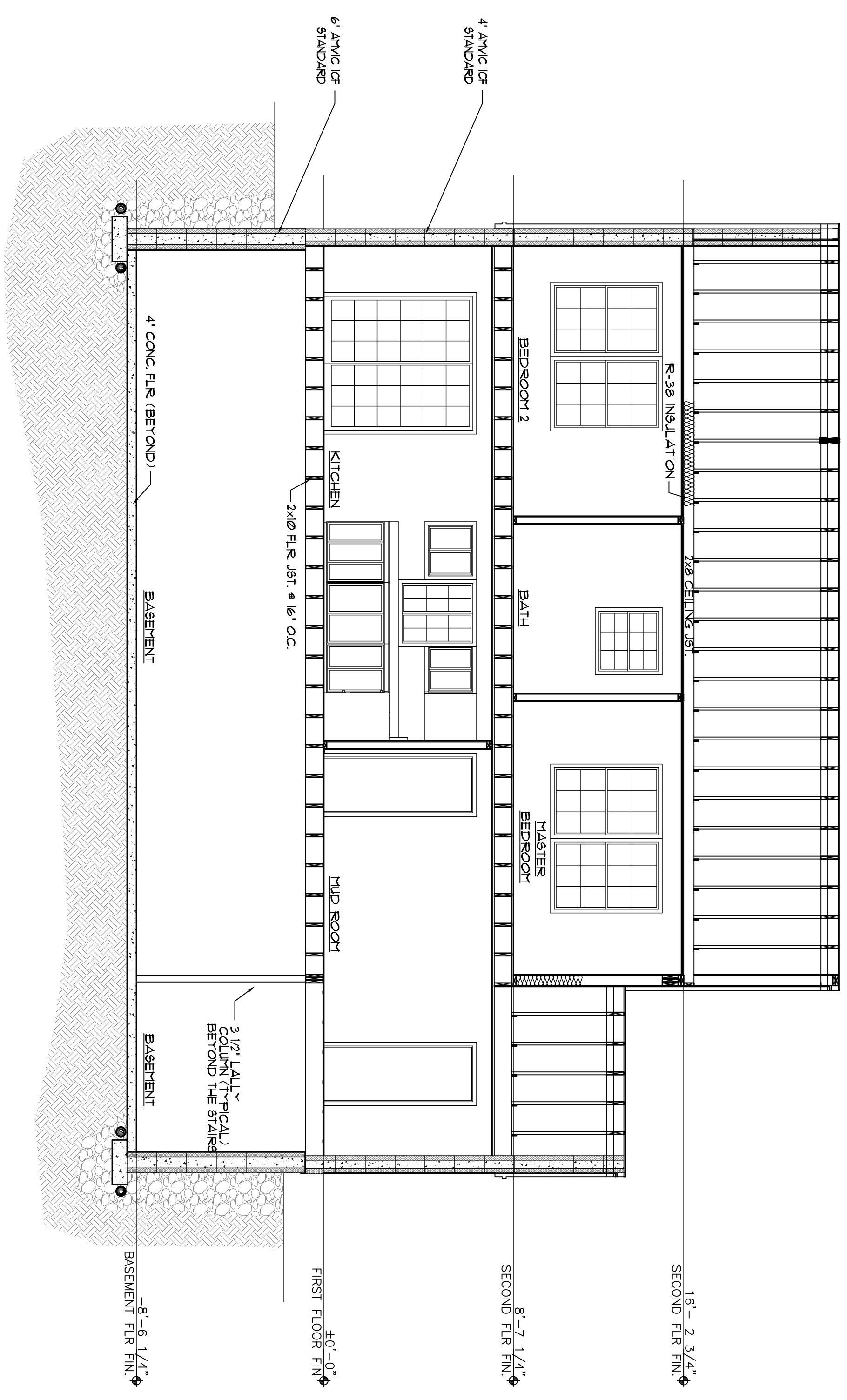
SECTION 1 SCALE: 1/4" = 1'-0"