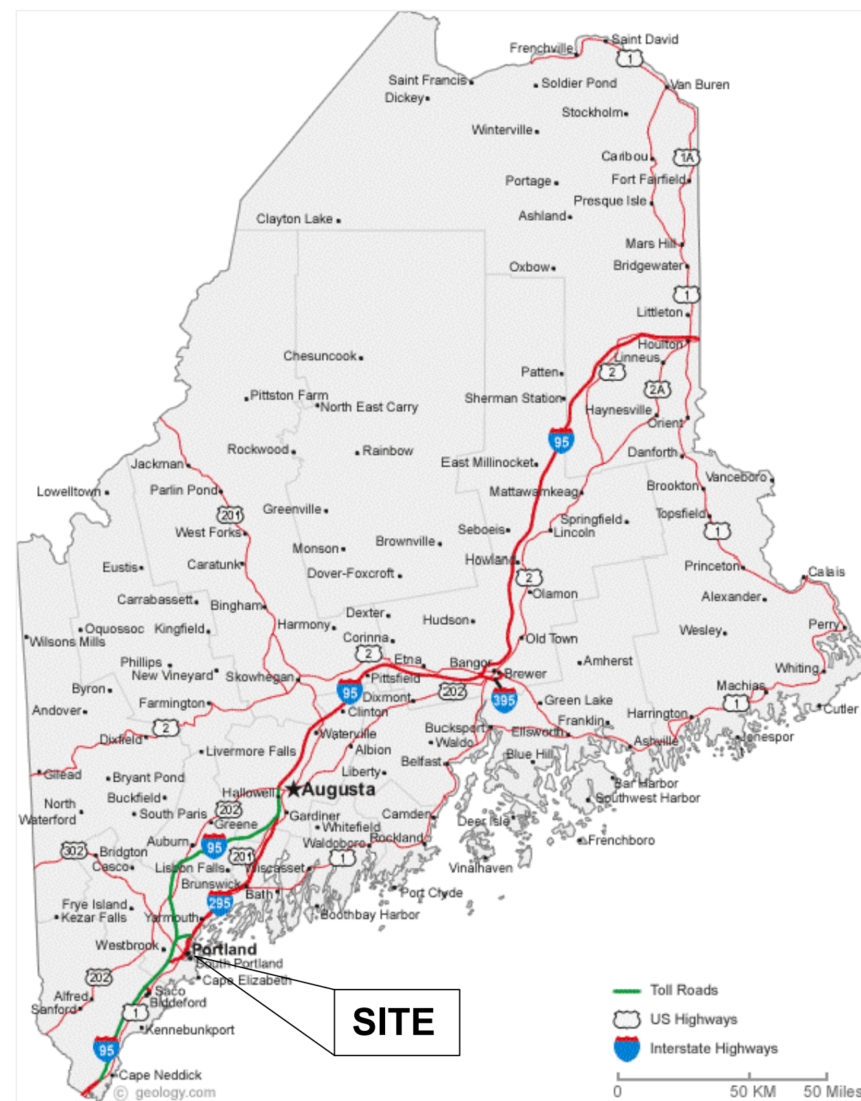
STATE OF MAINE