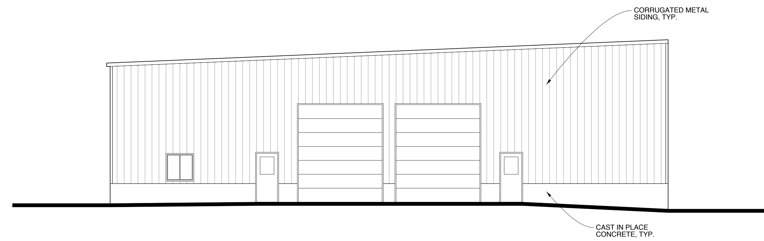
2 EAST ELEVATION SCALE: 1/8" = 1'-0" 2' 4' 8' 16'