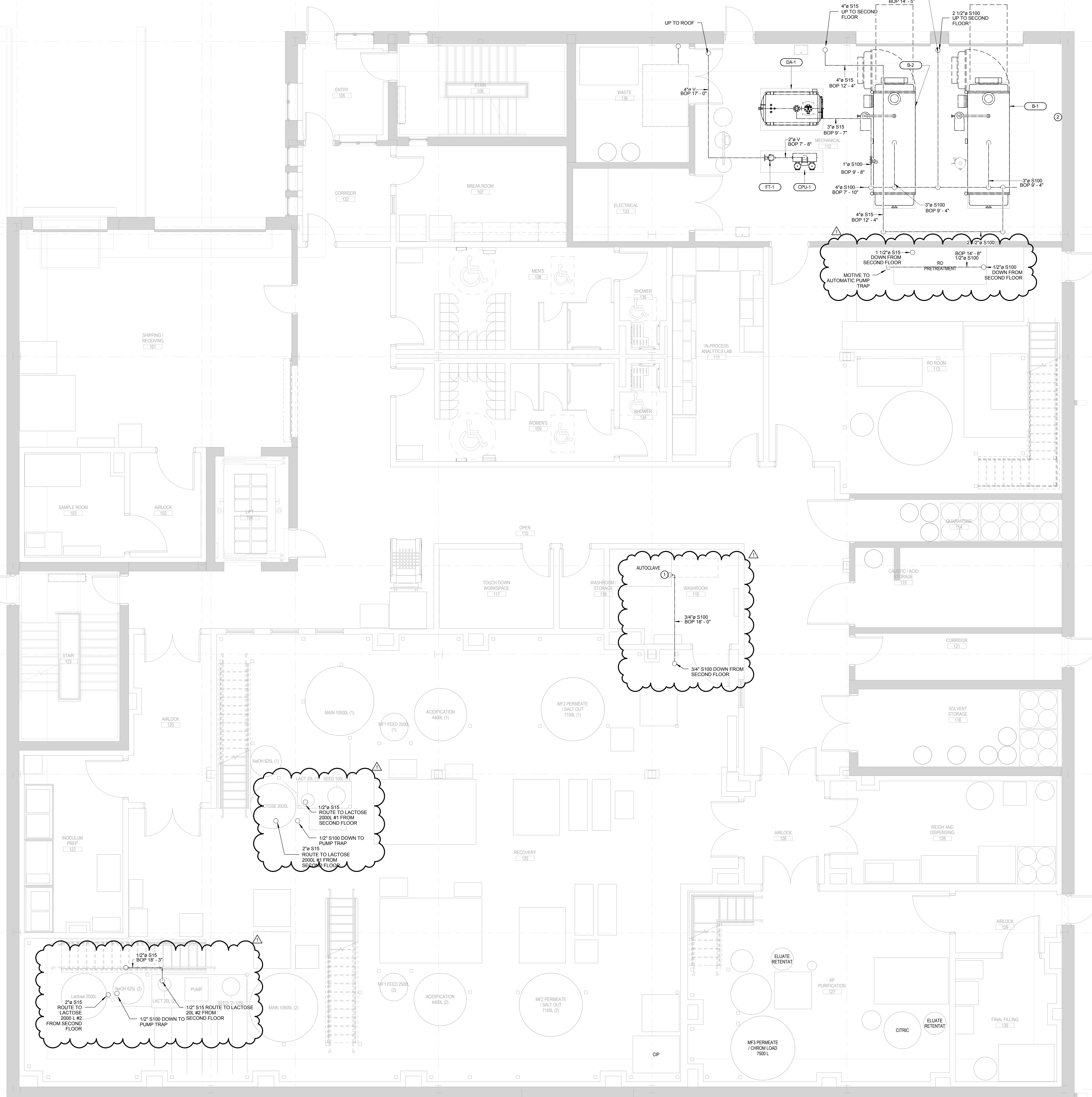
1 FIRST FLOOR - STEAM PIPING PLAN 1/4" = 1'-0"