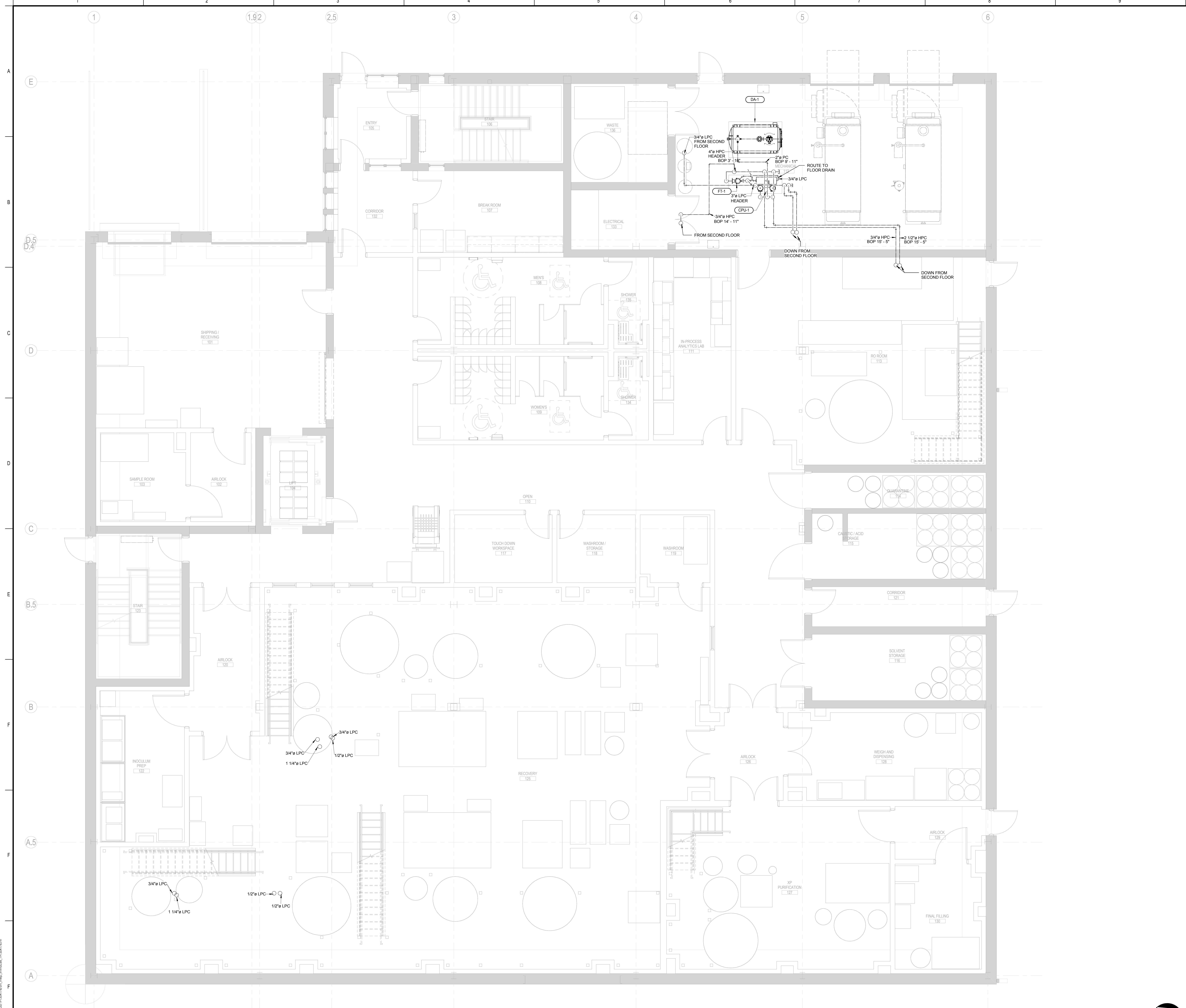
1 FIRST FLOOR - CONDENSATE PIPING PLAN MP-401-C 1/4" = 1'-0"