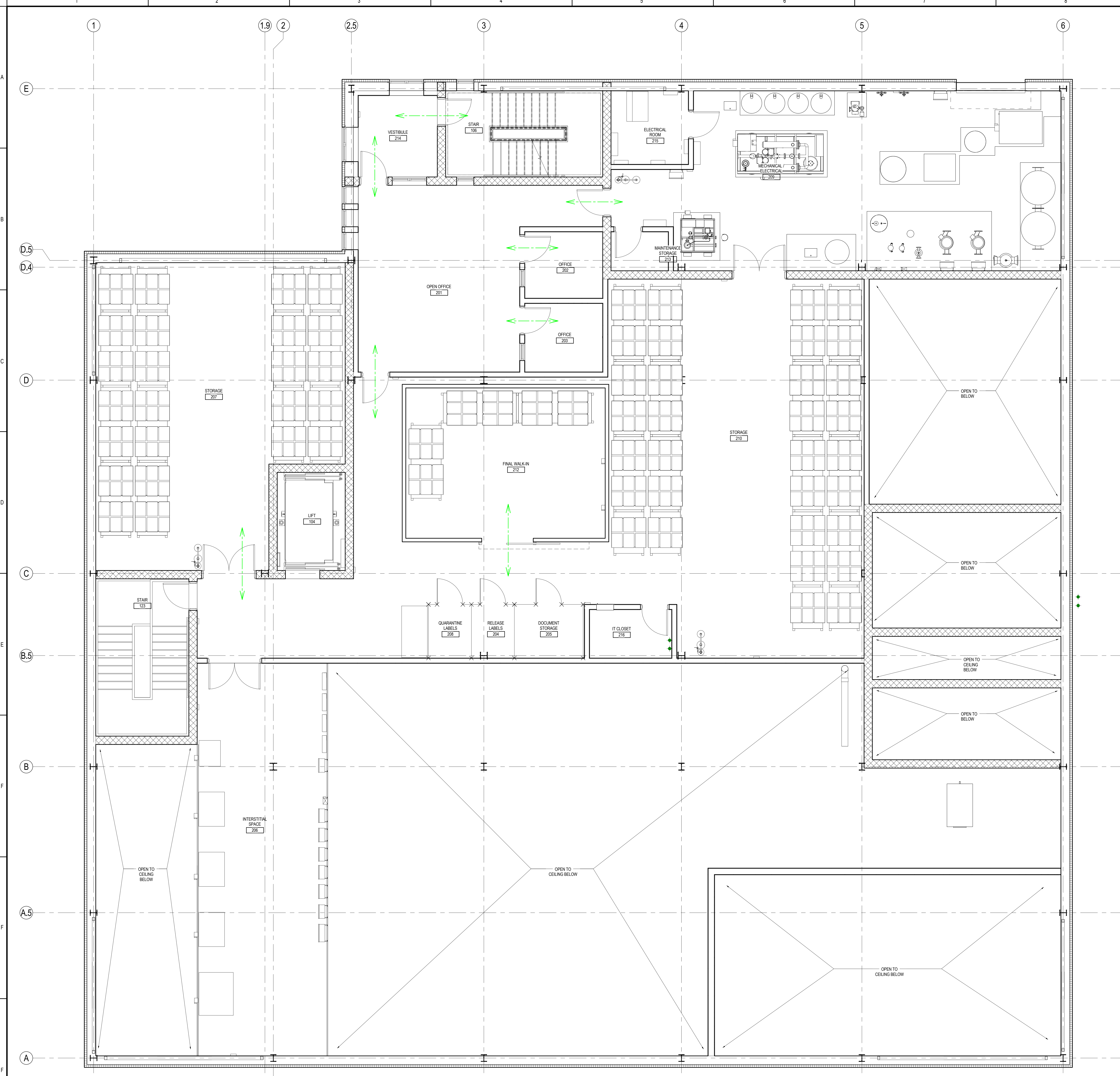
1 SECOND FLOOR PERSONNEL FLOW DIAGRAM G-110-C 1/4" = 1'-0"

ORIGINAL SHEET: A08 E (3/14/16) DESIGN: JLB DRAWING: JLB CHECK: JLB DATE: 08/19/2016