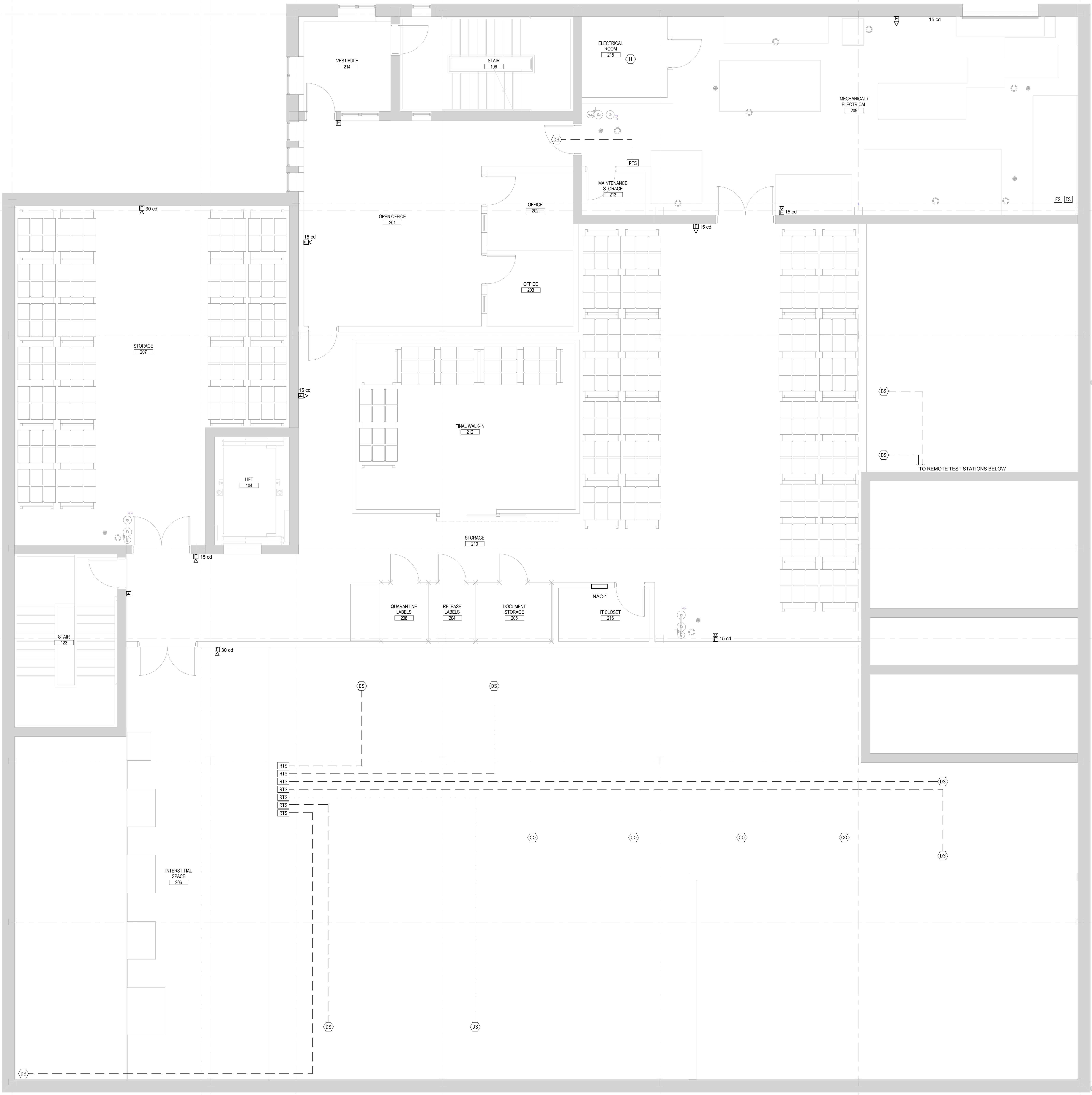
1 SECOND FLOOR - FIRE ALARM PLAN 1/4" = 1'-0"

E:\Projects\191504176\191504176_01_02\Fire Alarm\191504176_01_02_01.dwg 8/19/2016 10:42:23 AM User: jk Plot Date: 8/19/2016 10:42:23 AM Original Sheet: A0-E (of 4)